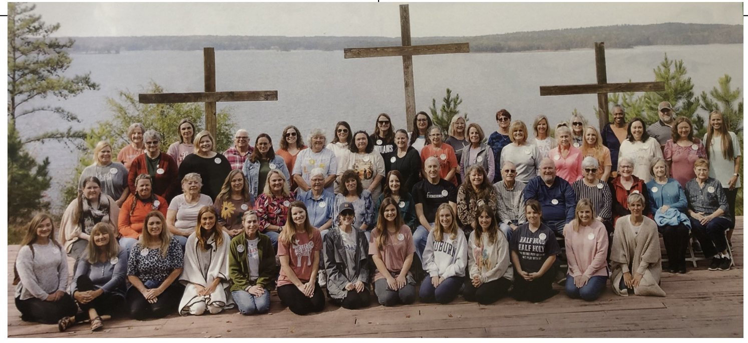
Welcome Women of CAEW Walk #218