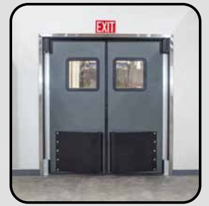
Shown in Metallic Gray w/ 24" bumpers