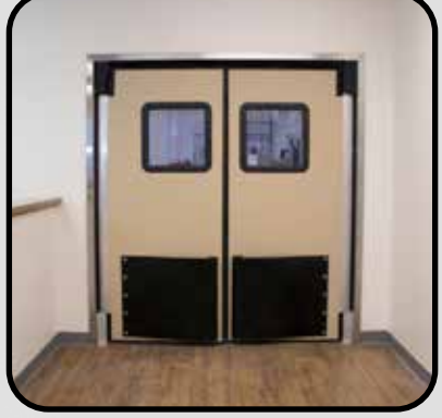
Shown in Beige w/ 24" bumpers