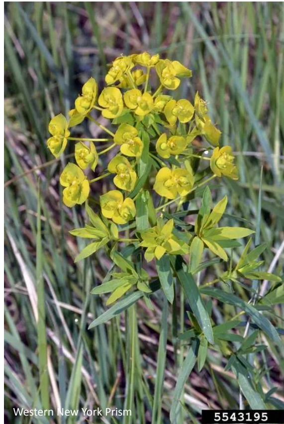
Western New York Prism