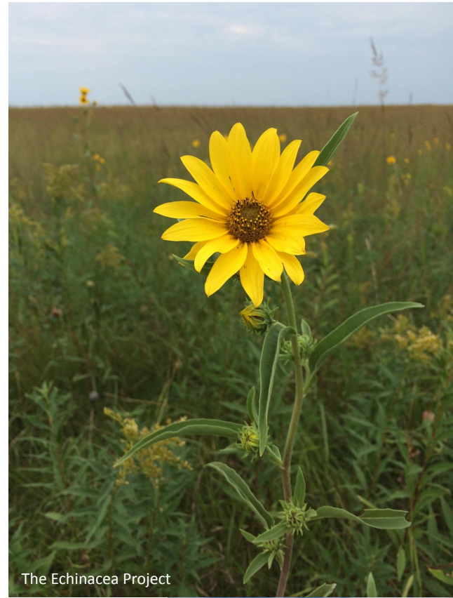
The Echinacea Project