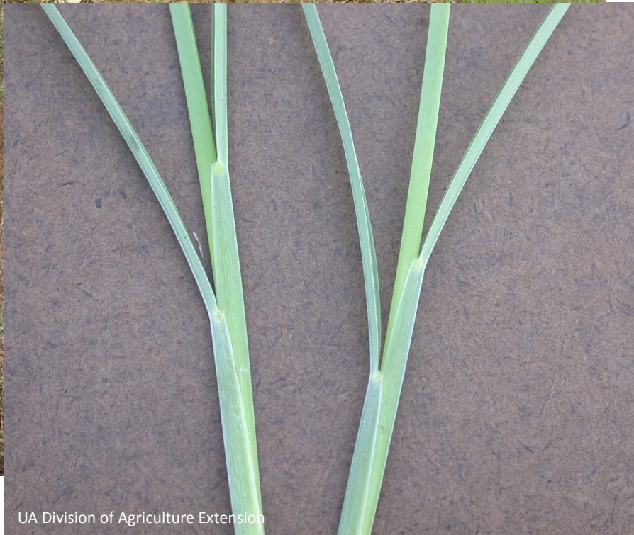
UA Division of Agriculture Extension