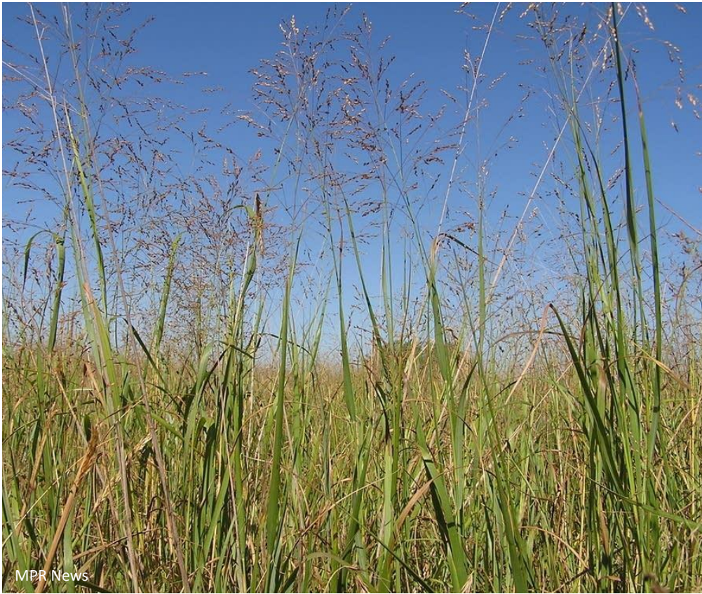
3-6 feet tall