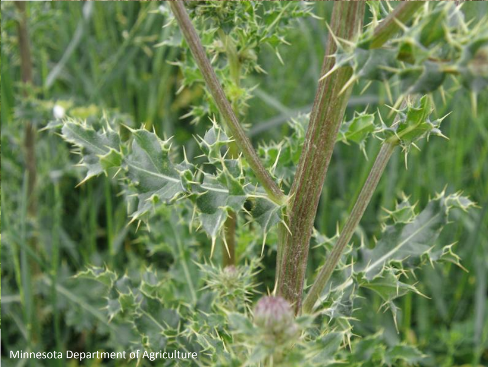
Minnesota Department of Agriculture