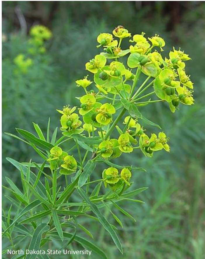
North Dakota State University