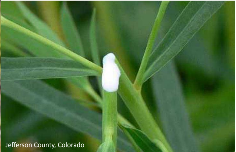
Jefferson County, Colorado