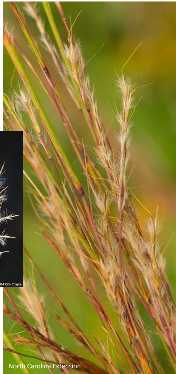
North Carolina Extension