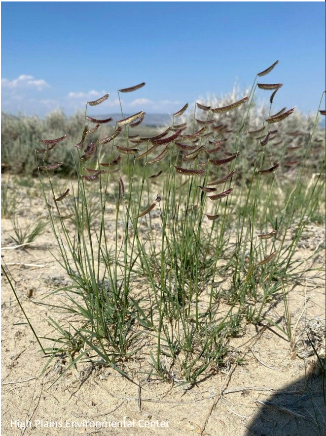
High Plains Environmental Center