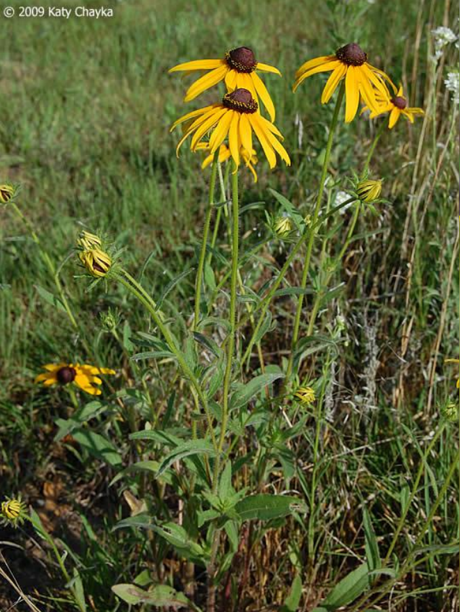
1-3 feet tall