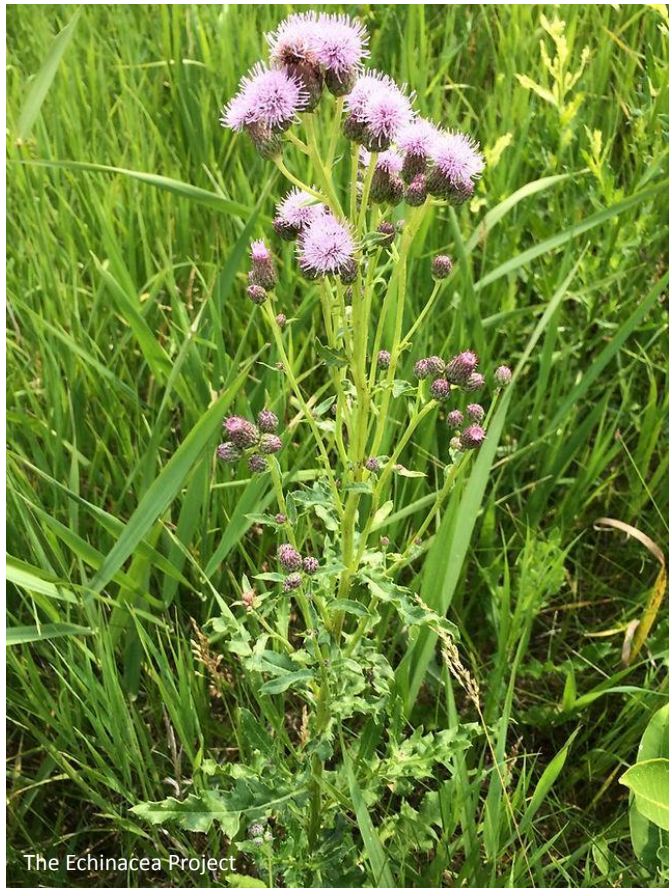
The Echinacea Project