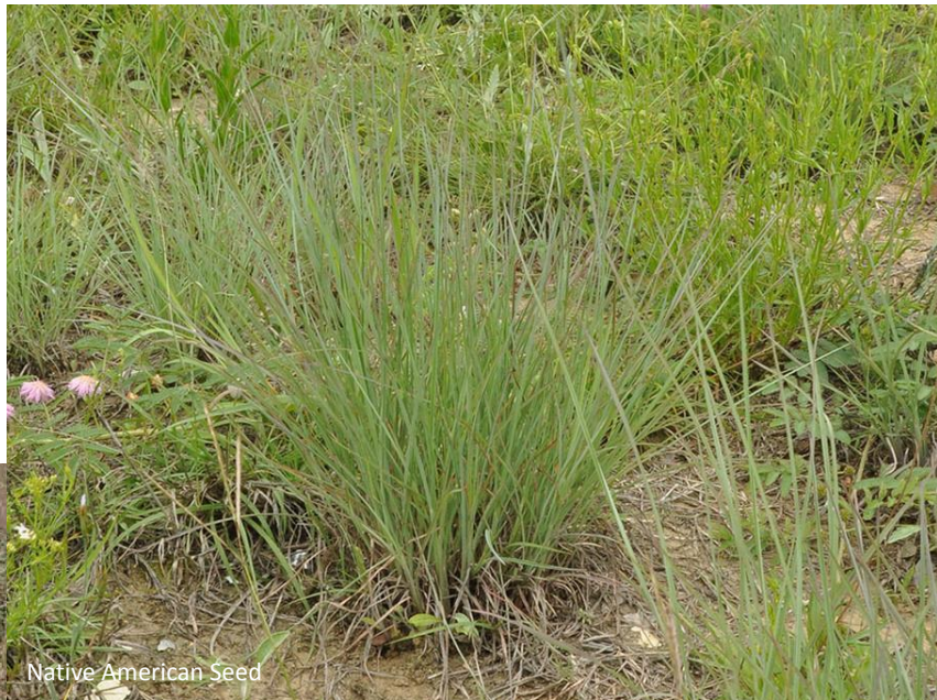
Native American Seed