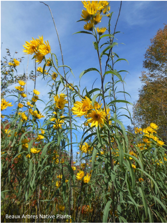
Beaux Arbres Native Plants