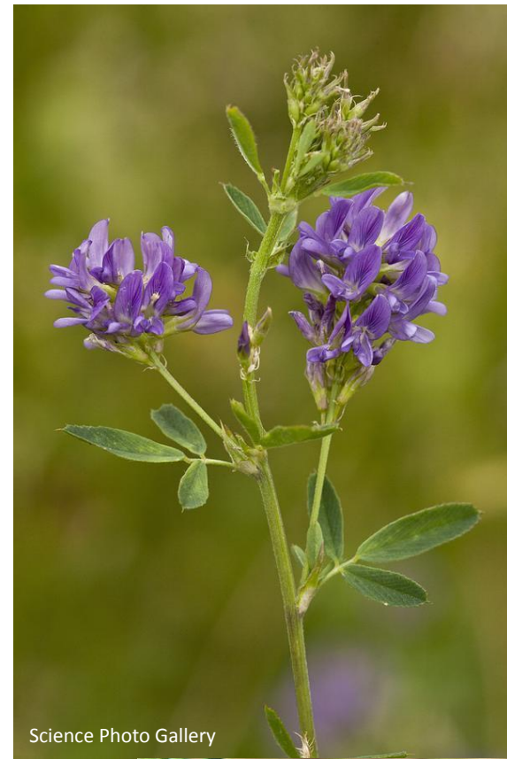
Science Photo Gallery