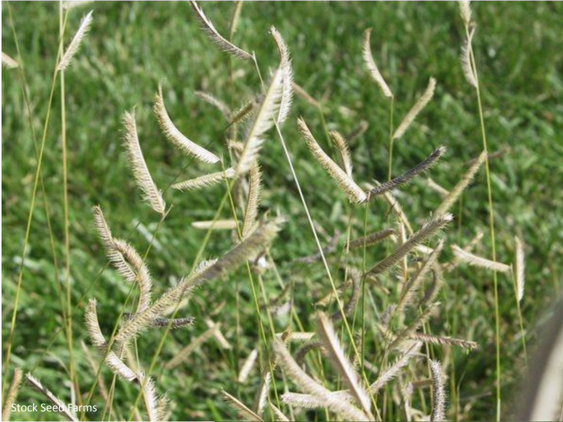
Stock Seed Farms