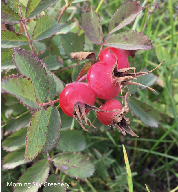
Morning Sky Greenery