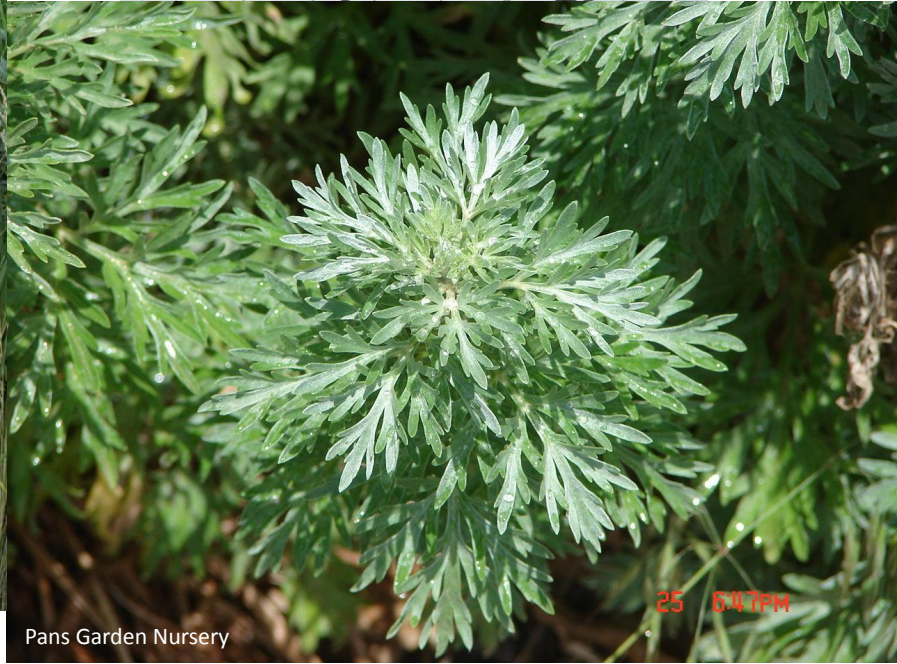
Pans Garden Nursery