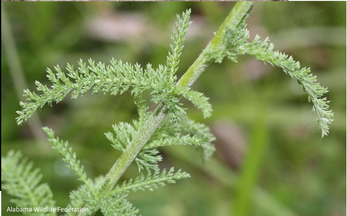
Alabama Wildlife Federation