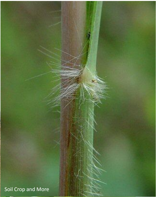
4-7 feet tall