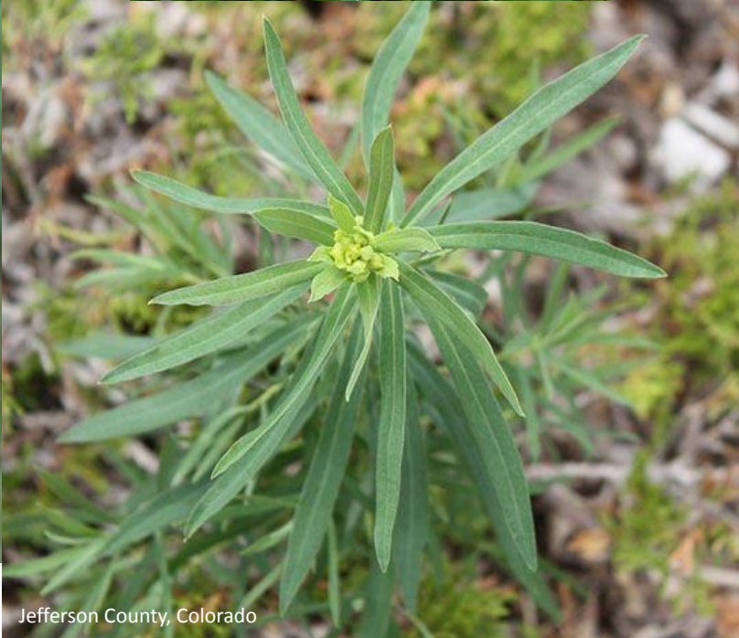
Jefferson County, Colorado