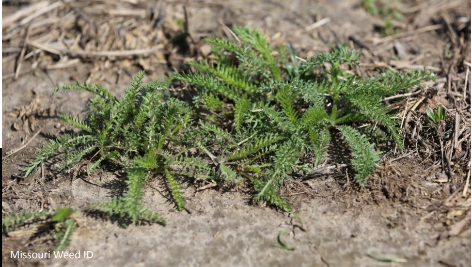
Missouri Weed ID