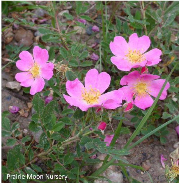
Prairie Moon Nursery