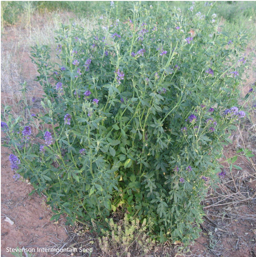
Stevenson Intermountain Seed