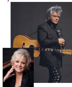
Marty Stuart with Special Guest Connie Smith