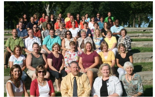
2010 participants pictured.