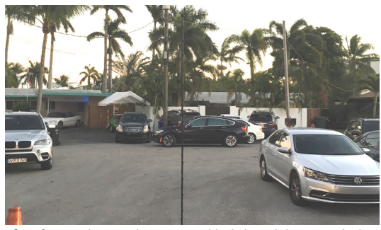
Cars for vacation rental party-goers block the cul-de-sac on Andros.