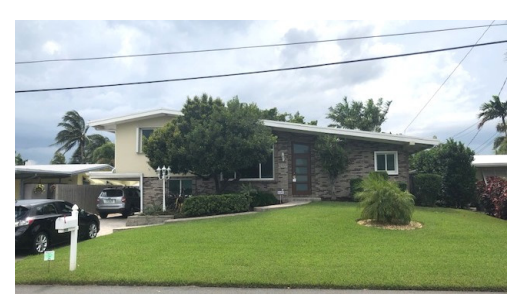
2455 Marathon: Notice the brick accent on the exterior of the house. The lawn is immaculate with the carefully trimmed hedges in the front. The three-light white post on the left side adds a beautiful accent that matches the white window frames in the front of the house. Beautiful .

Watch for your home in our next Newsletter