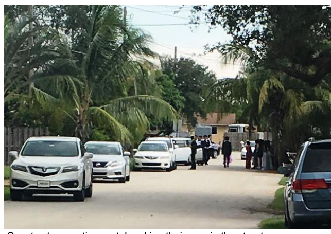
Guests at a vacation rental parking their cars in the street, a common violation. All cars must be parked on the property.

Should your guests decide to throw a party, become rowdy, noisy, drag race down the street, have guests park on our streets, decide to set mortar-style fireworks off after 10:00pm, chances are your street neighbors will call police, public safety officials and now the city code enforcement night team with complaints.