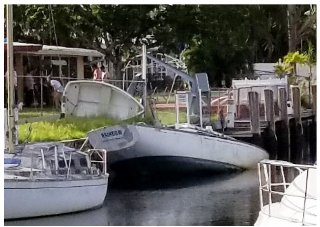
Luckily, there was no fuel spill associated with this old boat that sank on June 22.

The process for the City to handle sunken boats is "one step forward, three steps back," at least that's how it seems. The job of citing the boat owner or the property owner for a sunken boat is handled by Code Enforcement, and the process is entirely too involved and takes way too long.