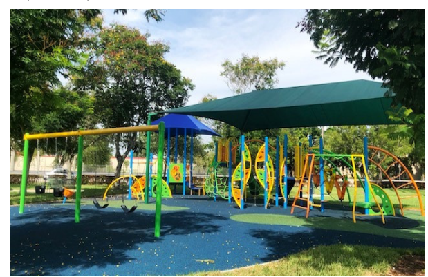
The new rubberized surface is easy on the feet.

functional, and very safe items. The new rubberized playground surface (not sand) is colorful, comfortable and fun to walk on.