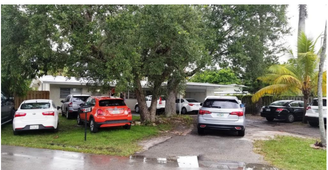
Another violation: All cars parked on the property must be on paved surfaces. There are also limits on the number of guests who may be present.

To report emergencies, please dial 911. For the Fort Lauderdale Customer Service 24/7, please call 954.828.8000. From Wednesday – Saturday nights, when the nightlife is most active the Fort Lauderdale Nite Team will also be on duty.