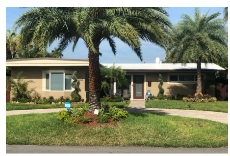
2536 Okeechobee: Notice the two twisting bushes - Wow! This home also added a bay window to the left side of house. They also have a large Canary Island Date Palm in the center island in front of the circular driveway. Beautiful .

This edition in the LICIA Newsletter will recognize one home each from Marathon Lane, Nassau Lane, and Sugarloaf Lane. Please note that in all three lanes at least 2-3 homes could have made the Newsletter. Congratulations to the three homes selected and being recognized. (Any residents that would like to join the "Beauty in the Isles" committee please call me.) It is a lot of fun seeing all the homes and talking to our neighbors.