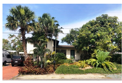
2549 Nassau: Note very lush tropical landscape and the immense avocado tree to the right. They even have orchids hanging in the shade of the avocado tree and large decorative stones that accent the front part of the yard. Beautiful.