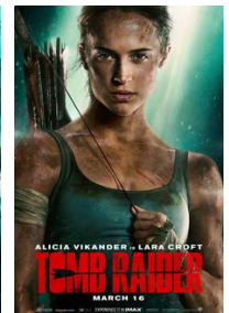
TOMB RAIDER 3/27