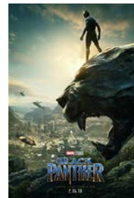
BLACK PANTHER 3/10

Don't miss the next Sensory Friendly Film!