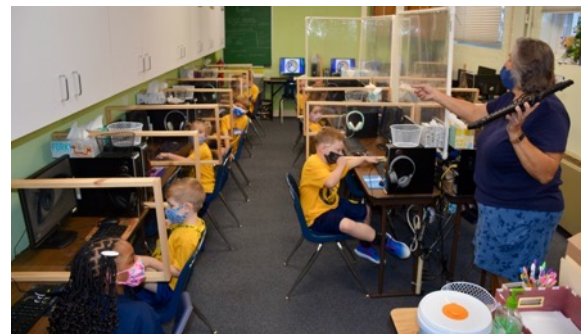
Kindergarteners had their first computer class.