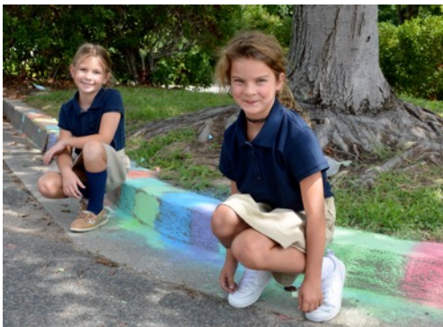
2 nd grade enjoyed their time outside at recess.