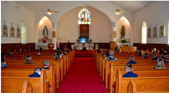
Grades 2-4 watched the ADW Mass from the Historic Church.