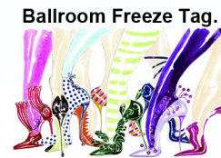
She smiled. We danced. She tagged me.

From a room of fifty players, across five game levels, using investigative dating tactics, the odds of meeting your match depends on sharing who you really are.