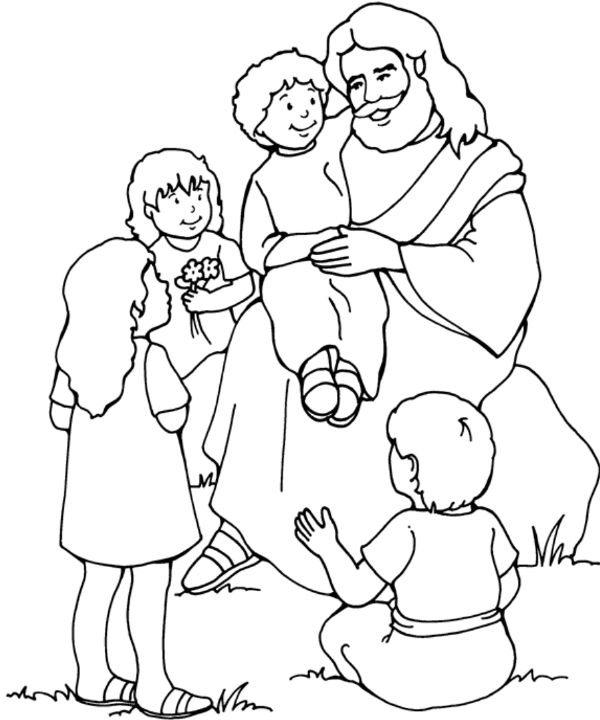
Jesus and the Children