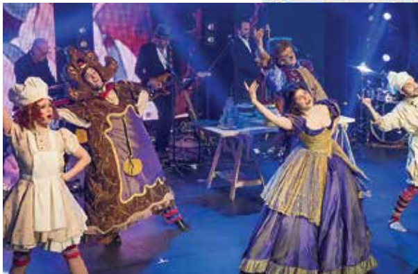
DIRECTOR AND CHOREOGRAPHER Beauty and the Beast Show