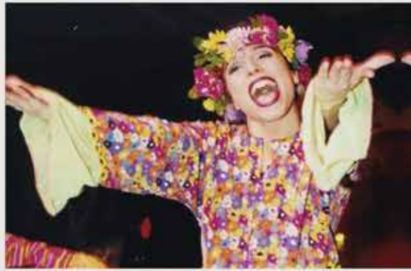
ON STAGE AT CAESAR'S PALACE Atlantic City