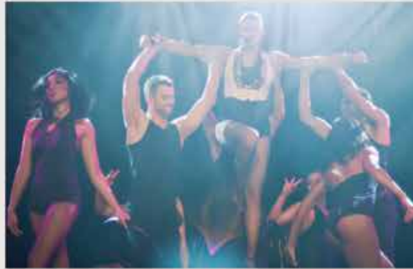
DIRECTOR, PRODUCER AND CHOREOGRAPHER Musical Show: Forever Broadway - Rialto Theatre