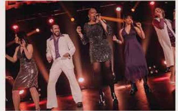
DIRECTOR AND CHOREOGRAPHER Saturday Night Fever