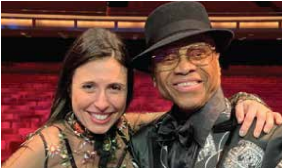
She had the distinct honor of directing Sonny Turner, the iconic 1959 lead singer of The Platters, in Montreal - Place Des Arts.