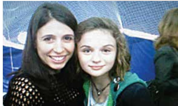
CHOREOGRAPHER On set with actress Joey King for the movie "White House Down"