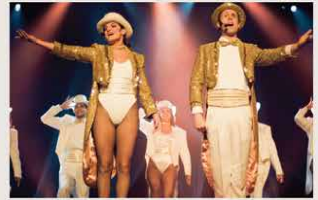
DIRECTOR, PRODUCER AND CHOREOGRAPHER Musical Show: Forever Broadway - Rialto Theatre