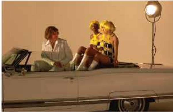
ACTOR AND CHOREOGRAPHER On set with Marc Labrèche