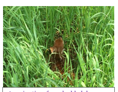
A springtime fawn bedded down.

On June 17, 2017, TEACH OUTDOORS was invited to host a fishing derby and duck calling seminar at Woodsmoke Ranch to help teach the skills of fishing to kids and adults who would like to fish but have never been fishing before. It's a great site because the kids catch lots of fish and have buckets of fun. More photos on p. 3.