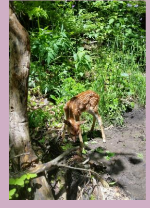
Photos: Above is the fawn that caught my attention that day. The lower picture is how we left her after she was returned to her hiding spot. Below is the lush valley before the climbing section of the trail near the skull rock formation. Pure natural beauty!