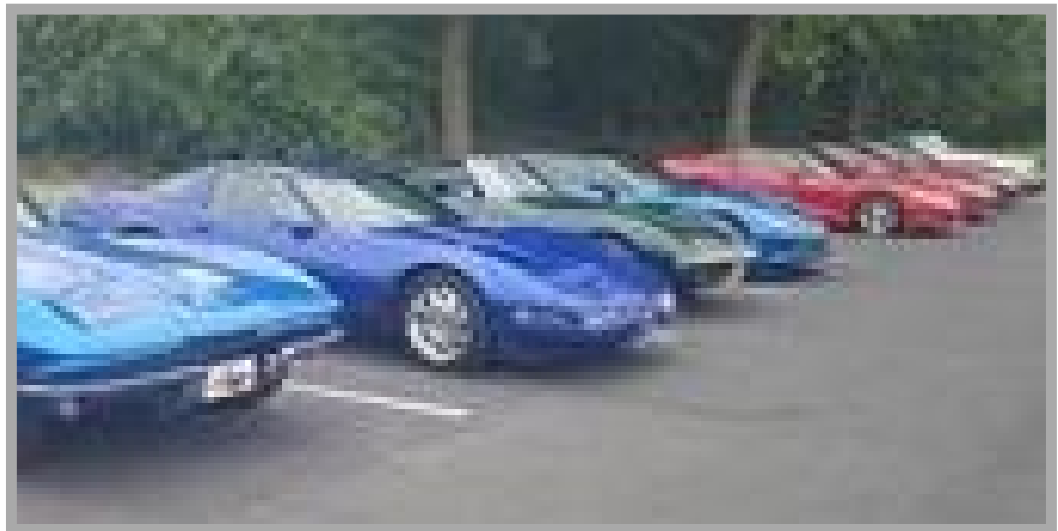
22 cars attend Memorial Day parade