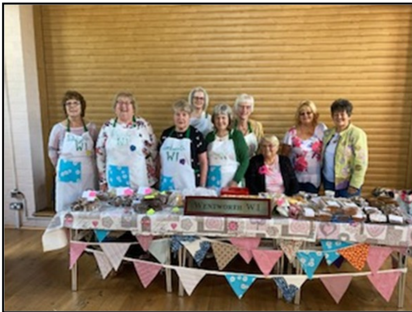
Wentworth WI stall at Harley Summer Fair on Saturday 28 August 2021