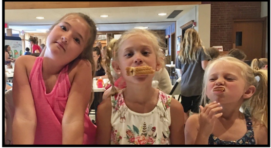
Day Camp (formerly knowns as Vacation Bible School)