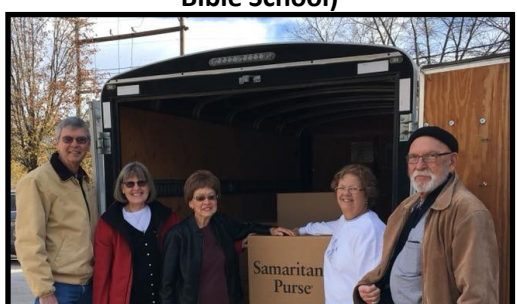
Operation Christmas Child