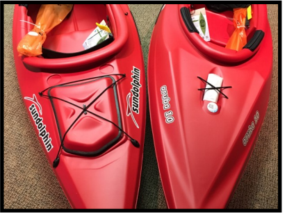
Kayaks for "K"amp "K"omeca