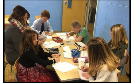
Christmas Cards to Stone Hearth