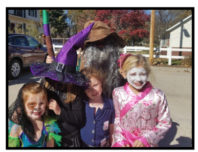
Trunk or Treat