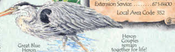
Great Blue Heron. Heron Couples remain together for life!

Living is easy in Dunnellon, a town that radiates Old Florida character and charm! Find yourself a cozy place to stay, then plan a shopping excursion, explore the variety of restaurants, float the Rainbow River, kayak the Withlacoochee, fish Lake Rousseau, hike & bike the beautiful terrain. Or just plain relax with friends old and new.