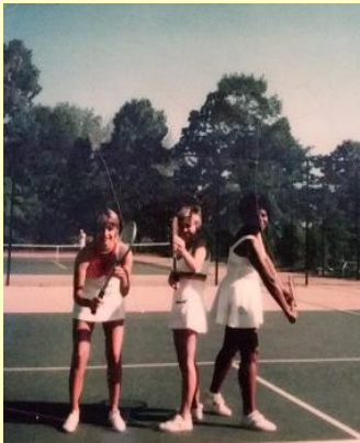
READY POSITION, SERVE, BACKHAND

NTTC has conducted Tennis Workshops in Raleigh, NC, Temple Hills, MD, San Diego, CA, Washington, DC. Seen on WRAL-TV and on WTOP Radio.