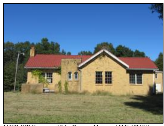
NCDOT Survey #51, Reece House (GF-8209), 5917 Burlington Road, looking north.

Location and Setting: The Reece House is located on the northeast side of two-lane US 70 (Burlington Road) just west of its junction with Knox Road in Guilford County (Figures 63–69). The property is bounded by woods on both the west and north, US 70 on the southwest, and the modern City of Greensboro water tower on the east. The immediate setting consists of a grass lawn planted with two mature trees to the southeast of the main house. An unpaved driveway runs to the east of the main house and terminates at the garage to the northeast of the main house.