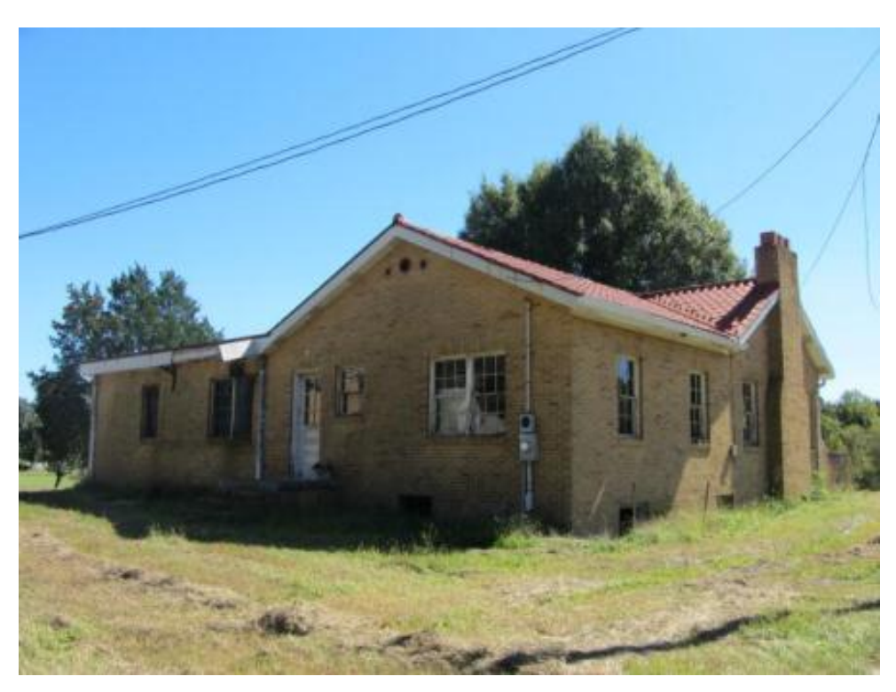
Figure 66. NCDOT Survey #51, Reece House (GF-8209), 5917 Burlington Road, Guilford County view of north elevation (left) and west elevation (right), looking southeast.