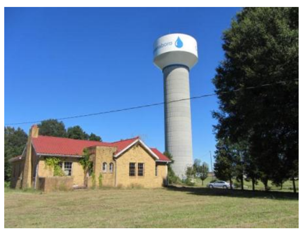
Figure 64 NCDOT Survey #51, Reece House (GF-8209), 5917 Burlington Road, Guilford County, view looking northeast with house in foreground and City of Greensboro water tower in the background.