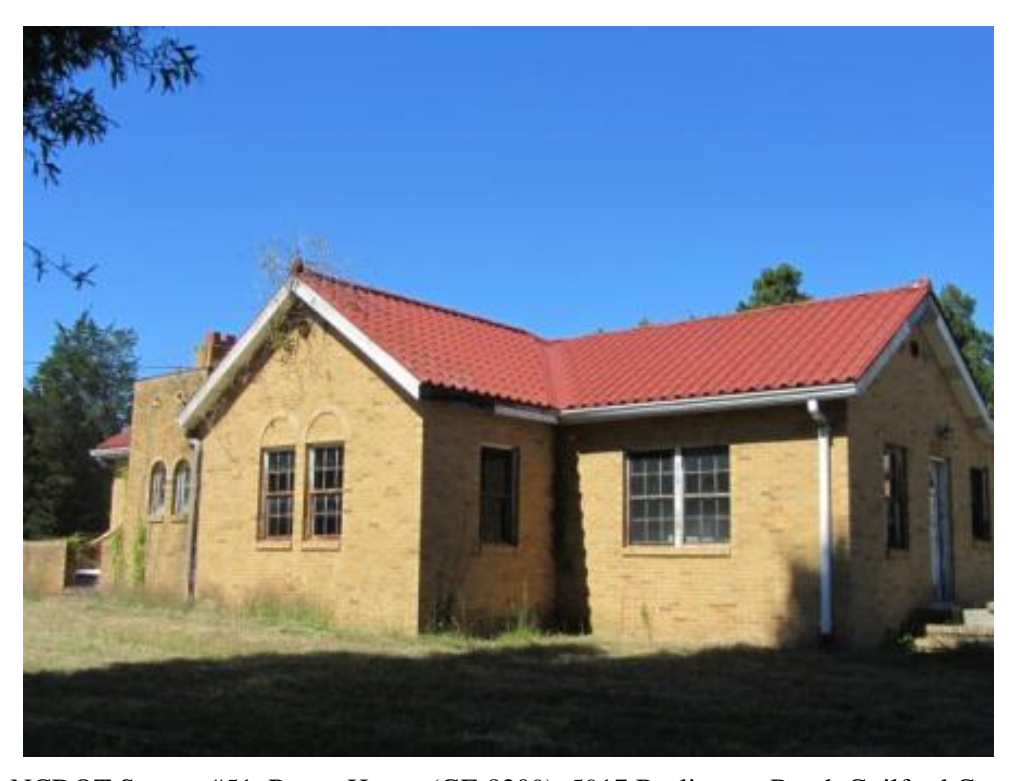
Figure 67. NCDOT Survey #51, Reece House (GF-8209), 5917 Burlington Road, Guilford County, view of north gable ell (left), looking northwest.