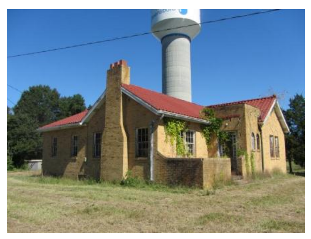
Figure 65. NCDOT Survey #51, Reece House (GF-8209), 5917 Burlington Road, Guilford County, view of façade and west elevation, looking northeast.