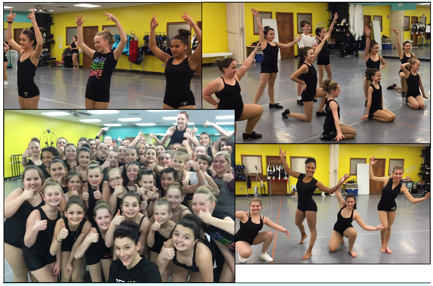
XENIA CHINA INN HOSTS SEASON KICK-OFF PARTY FOR DANCE FORCE