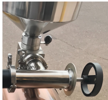
NEW FOR 2018! MDDS AIRFLOW SYSTEM FOR PRECISE AIRFLOW