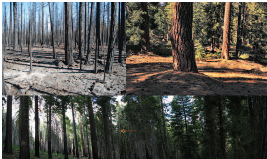
Figure 1. Top left is a California spotted owl Protected Activity Center (PAC) following the 2007 Moonlight wildfire. Top right is a Jeffrey pine with a thick duff layer accumulation around its bole in fire-suppressed mixed conifer. Bottom is a California spotted owl nest in a mixed-conifer forest that burned in a prescribed fire with mixed fire severity in 1997 in Yosemite N.P. Note the nest (shown by arrow) is in an area that burned at low severity and has high canopy closure. The nest is adjacent (<50 ft away) to an area (left one third of the photo) with lower canopy closure that experienced moderate fire severity. (Photo credit: Stephanie Eyes).

This unintended consequence of suppression-focused fire policy is not limited to forest with special designations. A particular problem in many productive, frequent-fire forests is the high duff accumulations that develop around large old trees in the absence of fuels reduction (Figure 1). Long duration smoldering burns can kill even large trees with thick bark (Ryan and Frandsen 1991, Hungerford et al. 1994). An analysis of factors associated with increased mortality found that when duff layers exceeded 5 in., the probability of mortality significantly increased, limiting conditions under which fire can burn without significant large-tree mortality (Hood 2010). The longer that fire is kept out of many productive forests, the greater the likelihood that burn intensity and duration will be higher than desired, im-