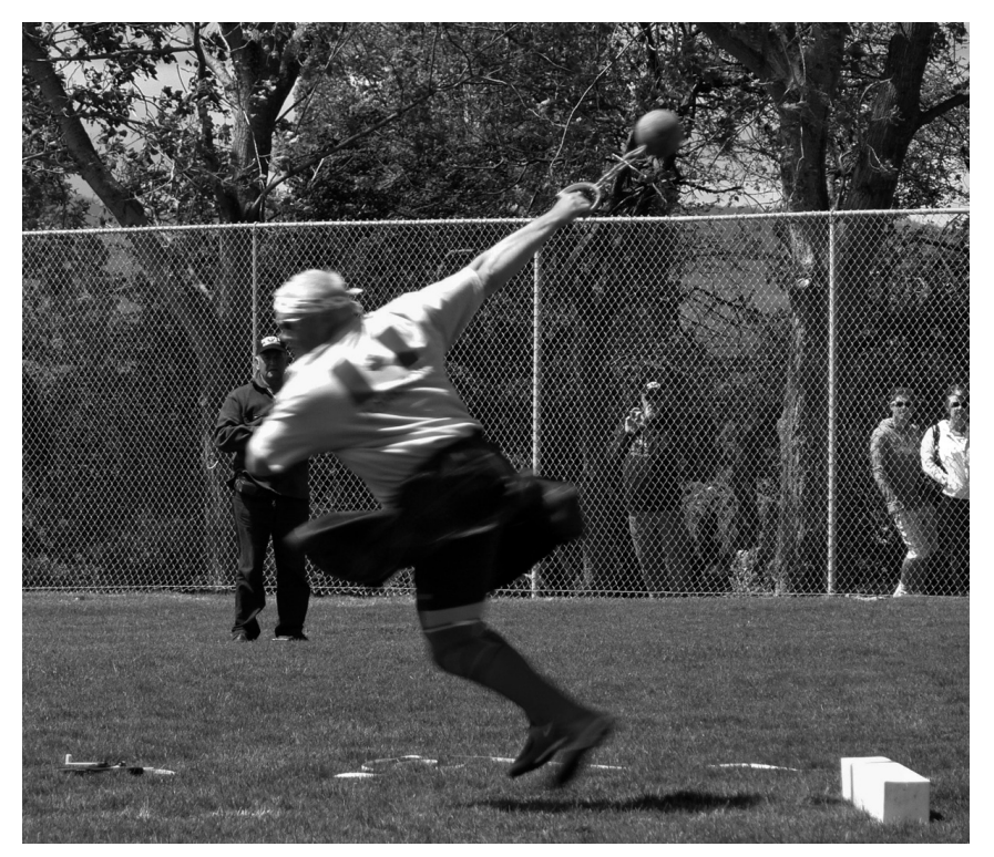
World Championship Heavy Events with competitors from Canada, England, Holland, New Zealand, Poland, Scotland and USA compete in eight events