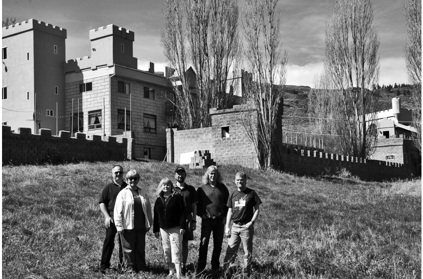
CMSC Newsletter # 52, Page 24