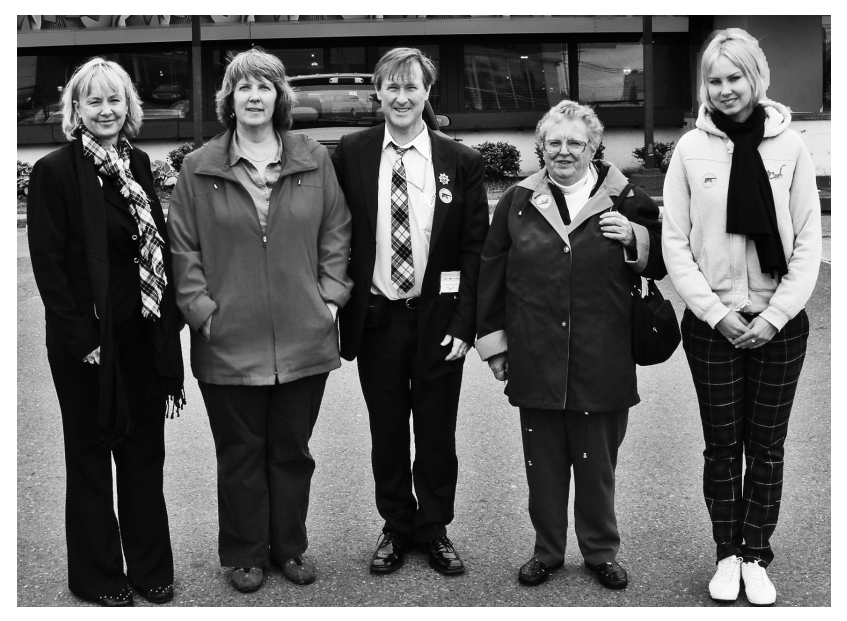
CMSC Newsletter # 52, Page 22

Our contingent from Canada is very excited about our meetings at Dunvegan for Parliament 2010 in Scotland. \Delta