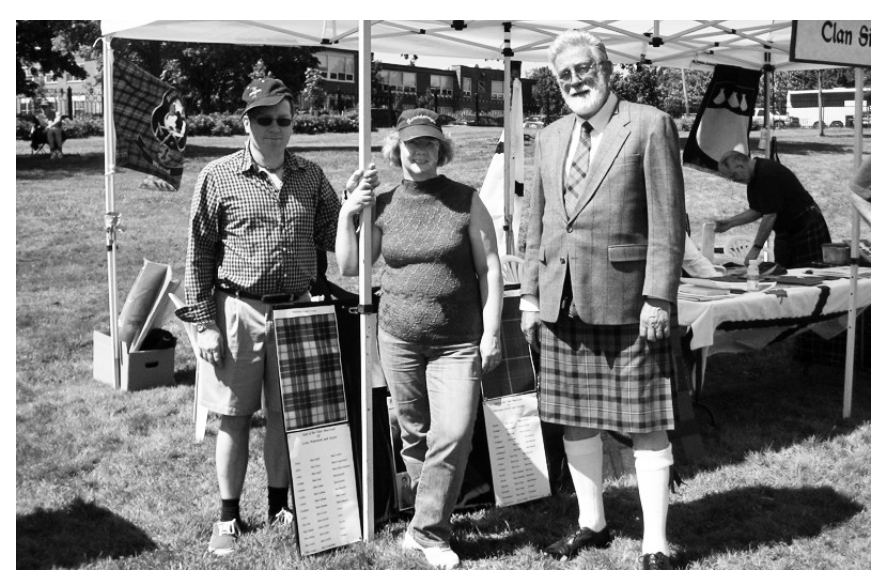
CMS Halifax ready to greet visiting MacLeods at 2009 Highland Games

Our Spring AGM will be held in early May, and members will be further advised of place, date and time. \Delta