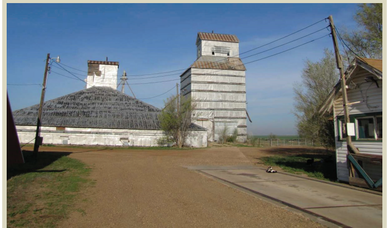
Baker Woodframe Grain Elevator, Baker (Riffe and Gilmore Company)