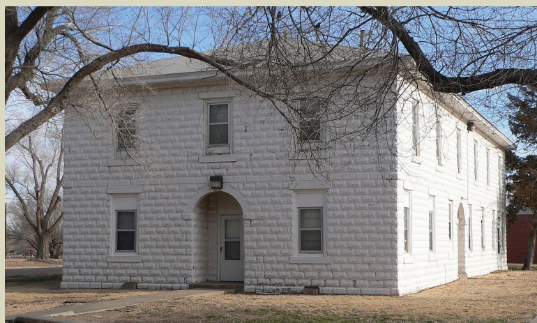
Franklin Hall, Goodwell

Located on the Oklahoma Panhandle State University Campus in Goodwell is a two-story building named Franklin Hall. The rectangular building was constructed during 1909-1910 at 201 College Avenue in Goodwell. It was used for student housing from the time it was completed, until around 2004, when it no longer met building codes. Deemed as fireproof, the rock-faced concrete structure was erected by contractor Frank Shinville, who also built the “cement stone” First Baptist Church building in Goodwell around the same time. Measuring 37