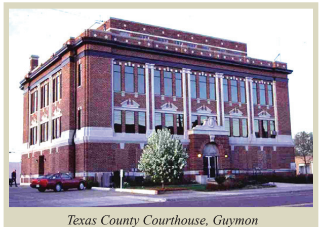
Texas County Courthouse, Guymon

The Texas County Courthouse was added to the register in 1984. Located at 319 W. Main Street in Guymon, the four-story structure was built in 1927 by Maurice Jaynes and the Kriepke Construction Company. It is constructed of red matt face brick of running bond masonry. The building is a combination of classical architecture and the north-facing entry features a pediment and cartouche. Pediments are also featured over the second story windows. A water table of buff stone is featured on the first floor and vertical pilaster strips separate all fenestration on the first and second floors. First-floor windows were bricked in