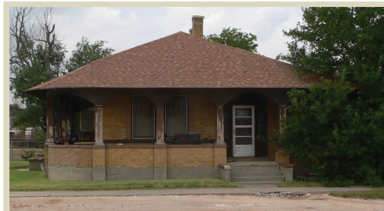
Penick House, Texhoma