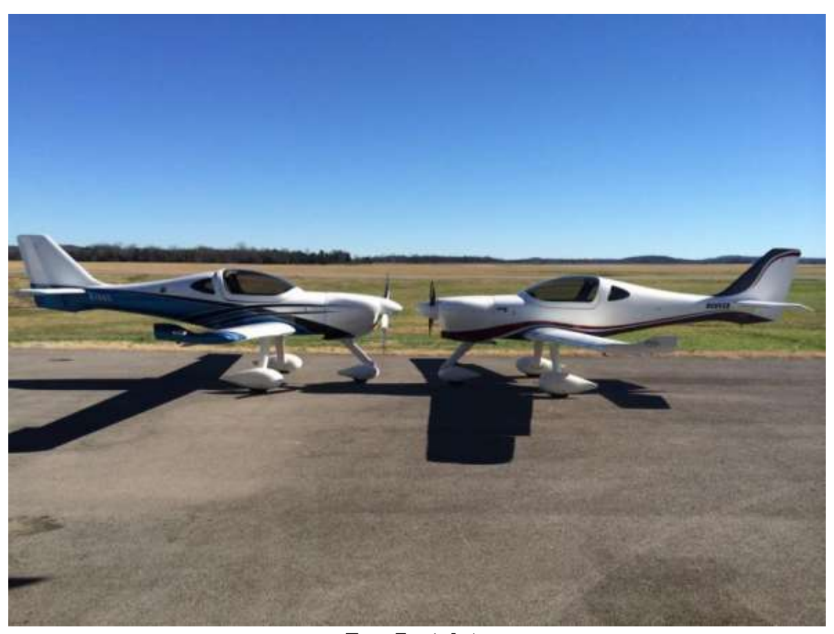
Two Fast Jets