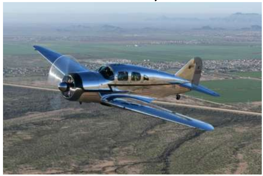
58th Annual Cactus Fly-IN Airport Identifier - KCGZ