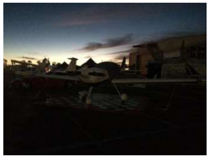
The Booth Closed for the Evening

At the end of the day on the last day of the Expo, we get a nice twilight photo of the XS. It was a good show and hopefully will eventually sell more than the one kit I know about. See you all there again next year.