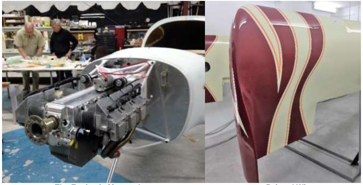
The Engine is Mounted