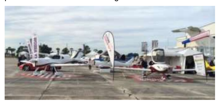
The Arion Booth

If you would like to look at all of the aircraft that were there, I am sure you can find them all at the LSA Expo web site, <u>US Sport Aviation Expo</u>. The following are pictures I took some other things to see around the show.