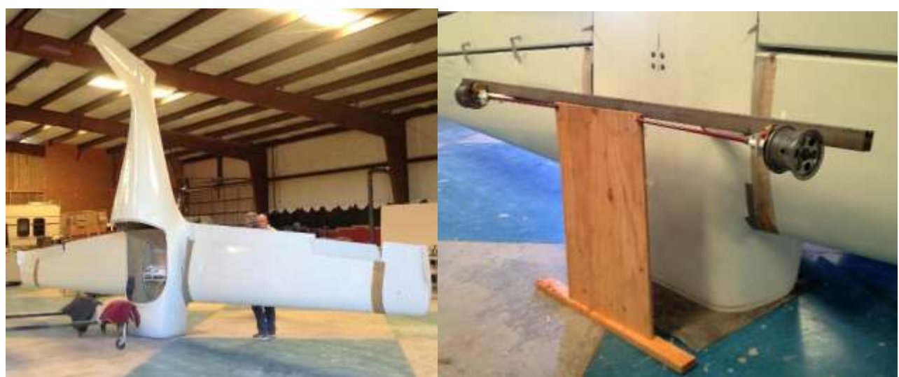
You Never Want to See This Again