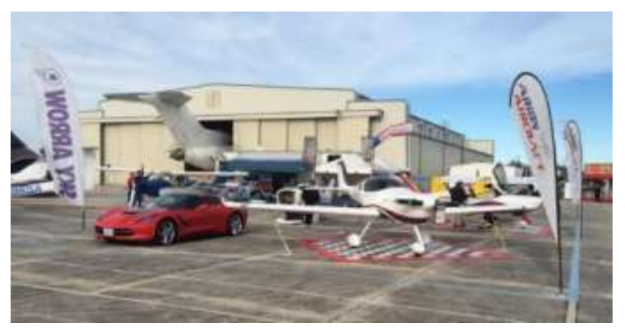
The Booth from a Different Angle

I always wanted to take a ride in one of these. Another day perhaps.