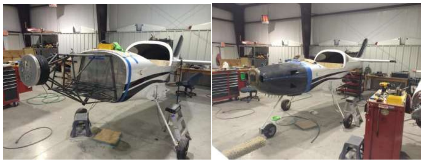
AEAC Electric Lightning Motor Mount and Cowling