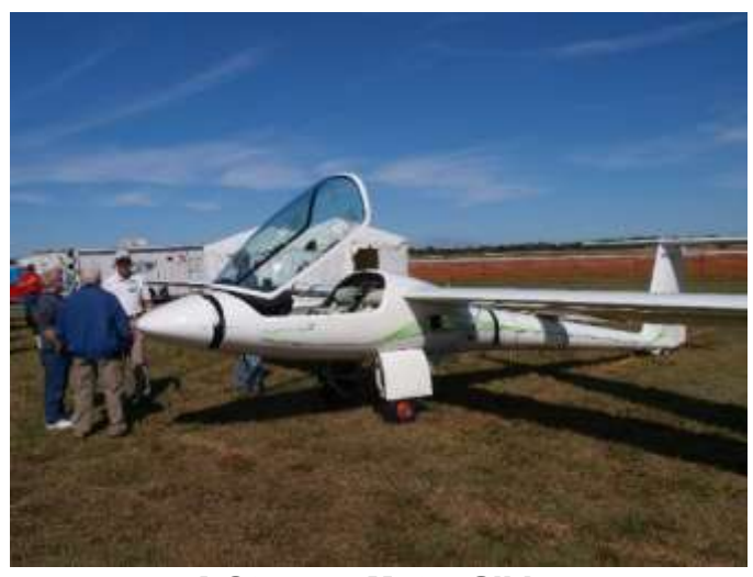
A Stemme Motor Glider

I always wanted to take a ride in one of these. Another day perhaps.