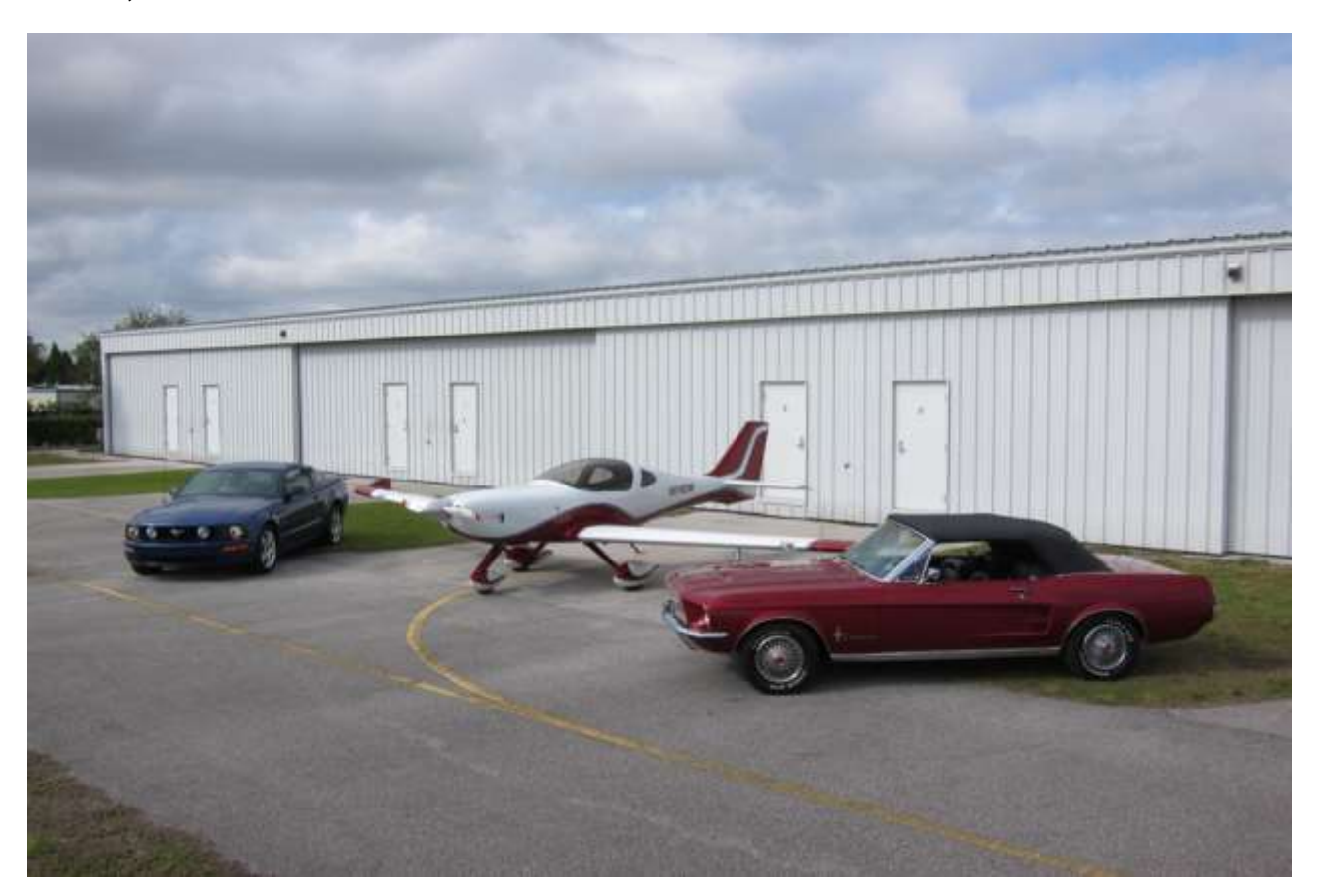
Two Mustangs and a Lightning

Russia and CIS, AVIA-NIANIA Ltd, Moscow, Russia, Phone: + 7495518-62-75, Mobile Phone: + 7925518-62-75, avianiania@mail.ru or avianiania@aol.com