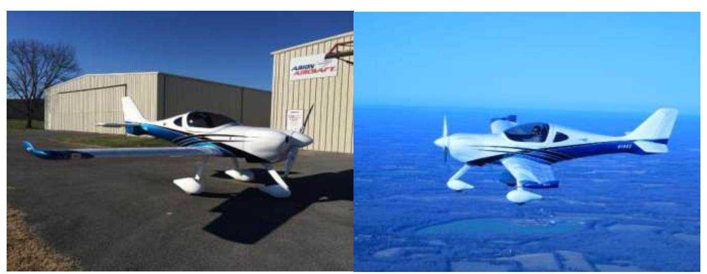
Neil Corella's Jet Finished and in Flight