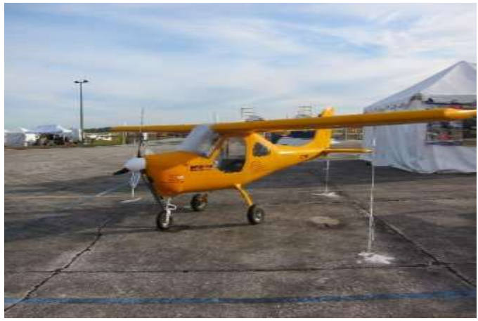
The Merlin PSA

There was a little plane at the show that may be getting some press. It is a small single place airplane that will have the capability to use a reciprocating engine or an electric motor. The Merlin PSA (Personal Sport Aircraft) is a kit built by Aeromarine LSA out of South Lakeland Airport in Lakeland, FL. You can do some simple searching on the web and get more information. Until the FAA is persuaded to change the Special Light Sport Aircraft rule, the electric powered plane cannot be certified as a Light Sport Aircraft. The company (and other hopeful electric powered aircraft manufacturers) are working to change the rule. They might get some high power assist since both Boeing and Airbus are looking at electric powered light aircraft.