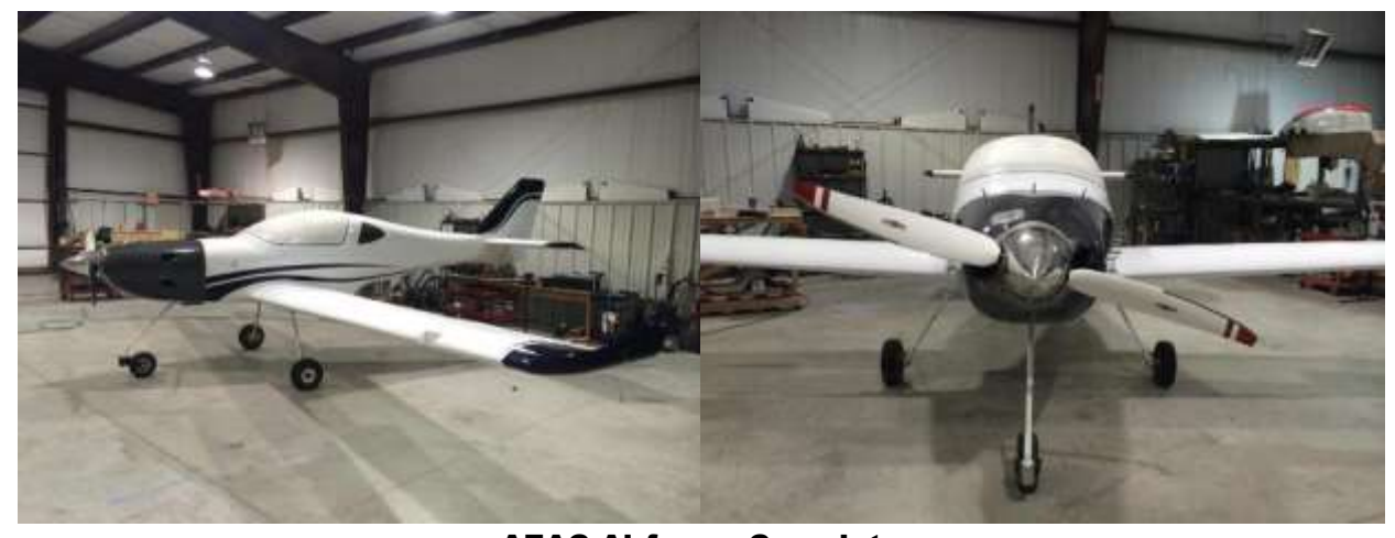
AEAC Airframe Complete