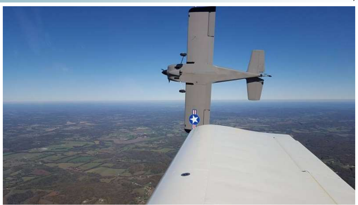
Nick's RV-6 – Break Off