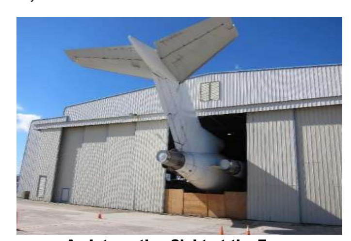
An Interesting Sight at the Expo

You almost never get a chance to see Crystal sitting. She is usually cleaning and waxing airplanes. Or on one cold Saturday morning, she made us hot cocoa. Thanks Crystal.