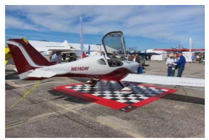
Greg Talking to a Potential Customer