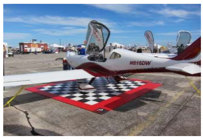
My Jet at the Expo

You are going to see a couple pictures of my Jet. I am writing the Magazine ©.