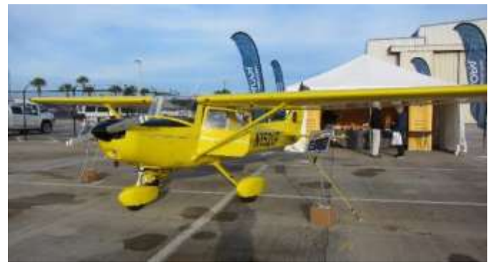
The AOPA C-152

AOPA had a presence as did the EAA. The South East Region representative (I may very well have his title wrong) was there flying in in his "company car", a beautifully restored C-152. The AOPA guys gave some forums and manned their booth and are very interested in helping people set up flying clubs. Having learned to fly in a flying club, I highly recommend this method for finding the least expensive method of obtaining your Private Pilot Certificate.