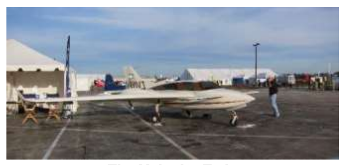
The Velocity Twin

As usual, Velocity was there even though they are not an LSA. They have been asked to show their plane at least the last few years and have flown it over from my home field, Sebastian Municipal Airport (X26)