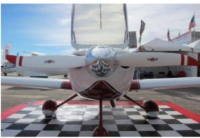
My Jet Again, with Some Reflections

At the end of the day on the last day of the Expo, we get a nice twilight photo of the XS. It was a good show and hopefully will eventually sell more than the one kit I know about. See you all there again next year.