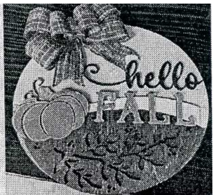
Cost 35.00. SEE BARTENDER FOR RESERVATIONS.