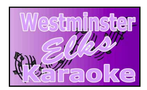
Sept. 6th & 20th 7:30 p.m. to 10:00 p.m.