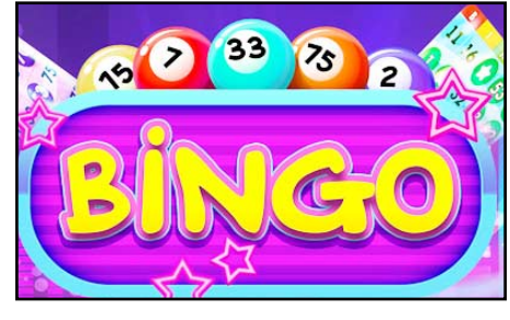
Sept. 4th & 18th 6:30 to 9:00 p.m.