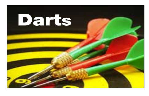
Every Thursday starting at 6:00 p.m.