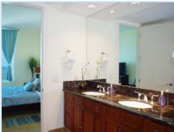
Master Bath #1