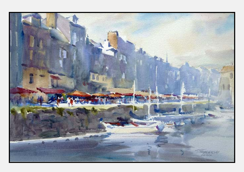
Honfleur Harbor Market