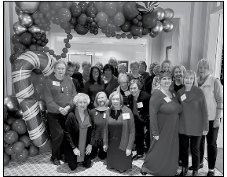
Christmas 2022 with the Morning Glories

We all enjoyed decorating the Wells Brown House in Stone Mountain Village on December 1, 2022. Using period appropriate greenery and adding clove