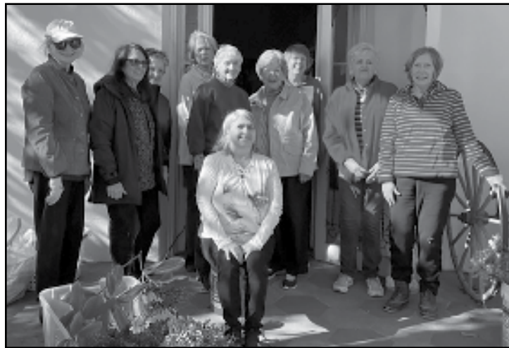
Morning Glories decorating team at the Wells Brown House

studded oranges for scent created a lovely winter décor for the Stone Mountain Historic Society’s Open House on December 2.