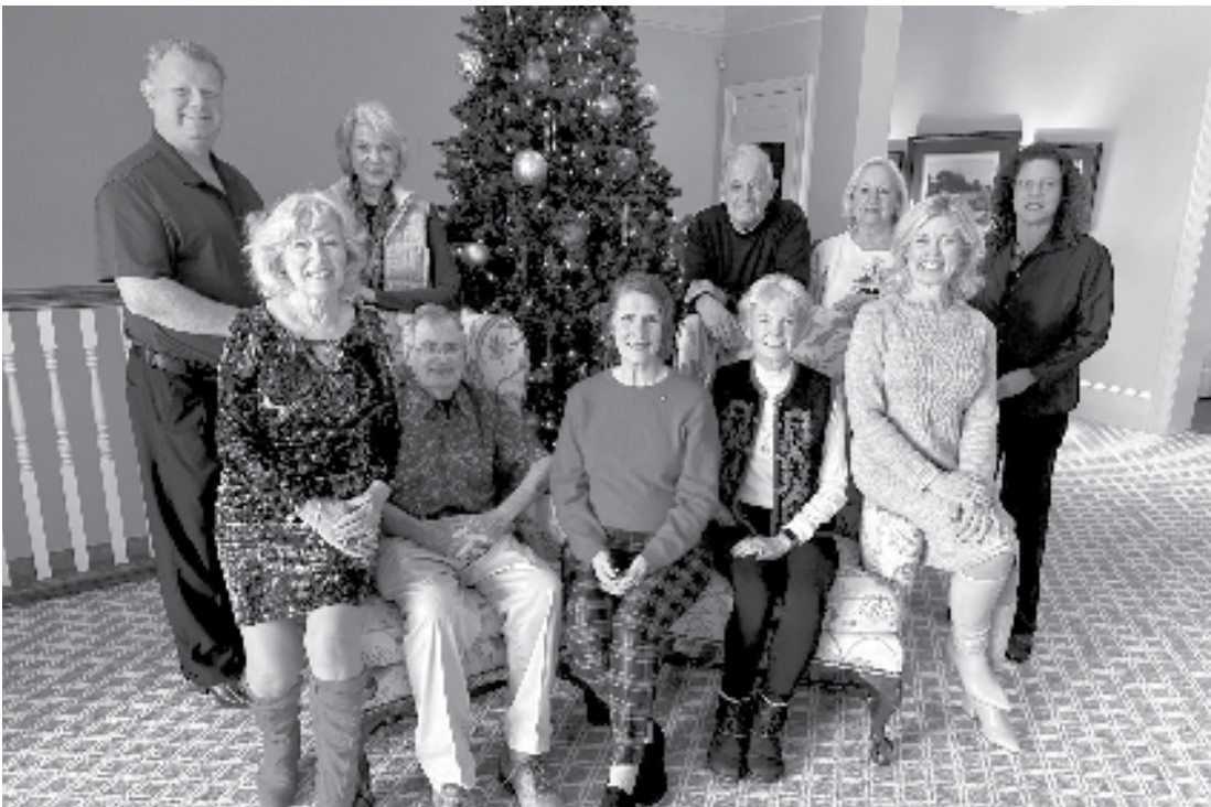
Smoke Signal Staff annual Holiday Luncheon at the Smoke Rise Country Club Wishing you all good things in this New Year!

Happy New Year 2023 from the staff of the Smoke Signal