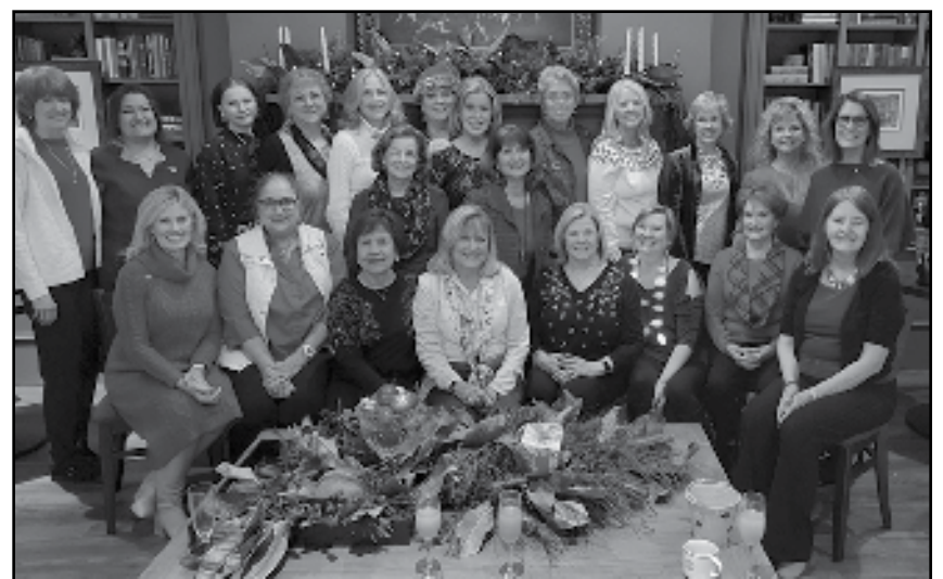
Mountain Mums met at Smoke Rise Country Club for lunch and Dirty Santa