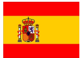
Spanish for the 4s

In Spanish, we are learning about places in our city; church- iglesia , school- escuela , library- biblioteca , shoe store- zapatería . We will be learning about Spanish words for types of transportation just in time for Transportation Week; car- coche , bus- autobús , bicycle- bicicleta , plane- avión , and many more! Finally we will take the last couple of weeks to review all of the vocabulary words we've learned this year; colors, animals, body parts, verbs, feelings, weather, clothing and food. We might even have a chance to dance to the Halloween Monstruos song again! I've had a wonderful time teaching your children a new language and hope they continue to build on this knowledge and sing the songs we learned throughout the year.