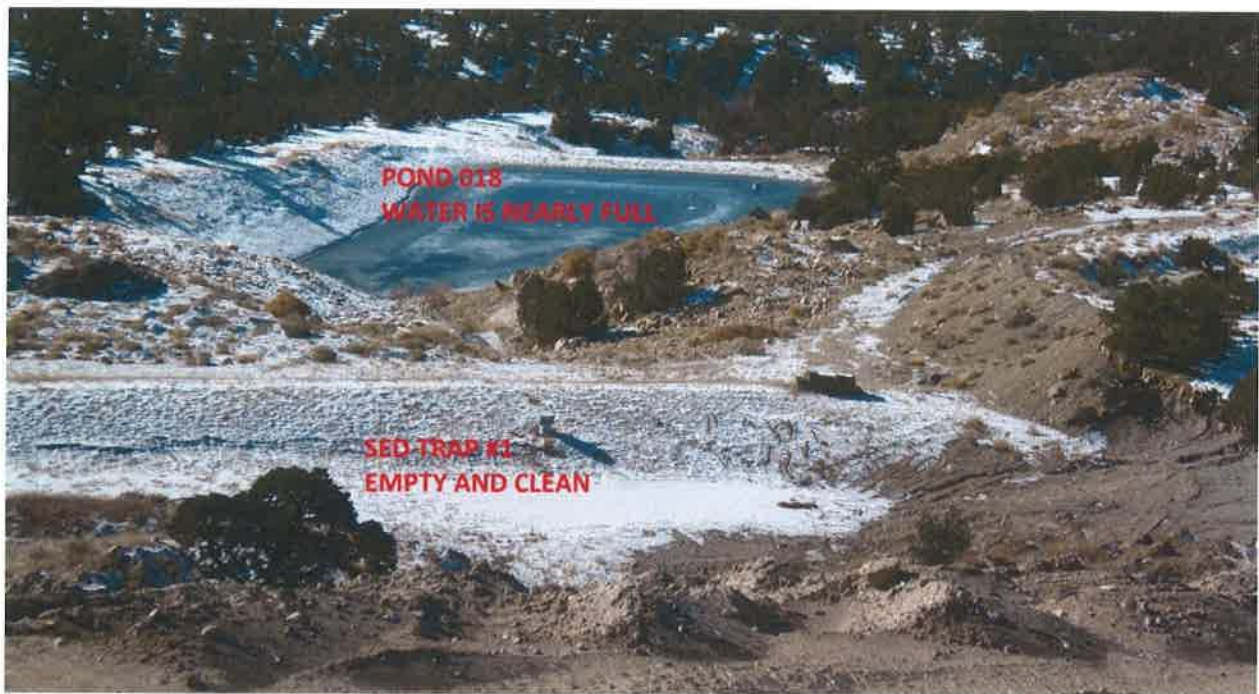
Sediment Pond 018, located west of Sed Trap #1 – photo looking westerly