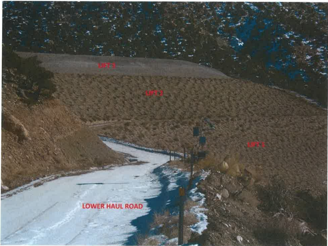
SCA#2 Ash Landfill –looking southeasterly