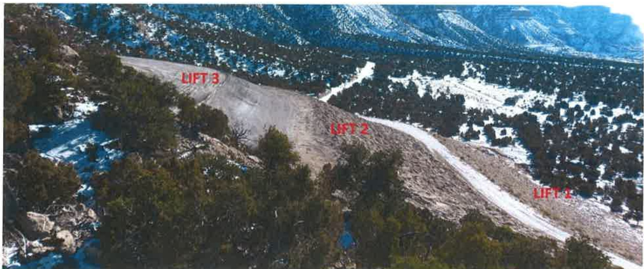
SCA#2 Ash Landfill – west face looking southerly Lift #1 and #2 covered and seeded, vegetation is growing. Lift #3 in process