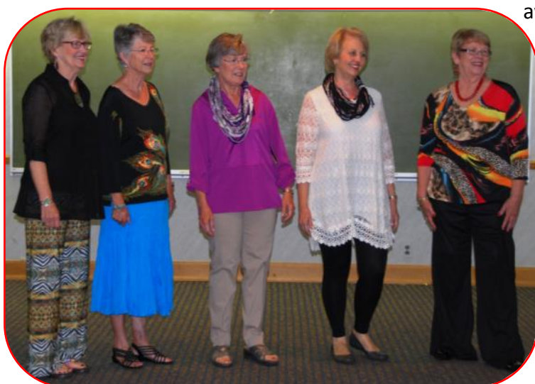
Our lovely models showed off some local fashions during the ladies luncheon

That night we had roast beef with potatoes, broccoli cheese, salad and pecan pie -- most delicious. We were then entertained by a DJ from Tyler who played all our