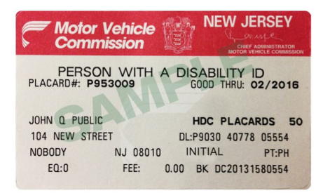
FIGURE 2: Permanent Person with a Disability Placard