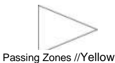
Passing Zones // Yellow