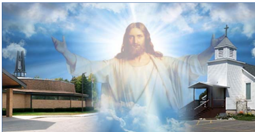
Resurrection of the Lord Parish

St. Joseph 7842 Newberry St. Alger, MI 48610