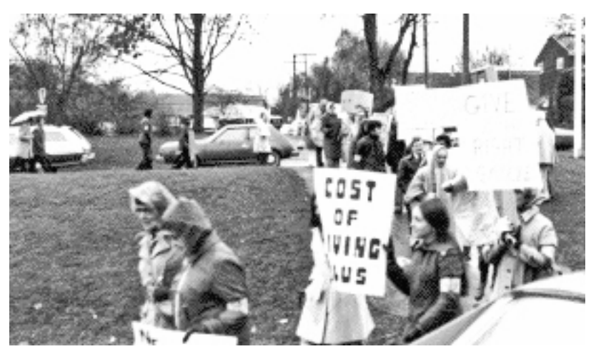
Contract Negotiations - 1974 Teachers marching at West Genesee Junior High School

The New York State Teachers Retirement System created Tier 2 in 1973.