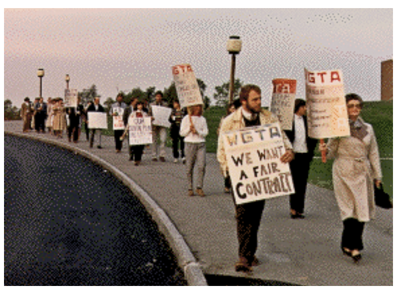
1985 Contract Negotiations Camillus Middle teachers demonstrating their support

In 1985 the West Genesee teachers rejected a tentative contract agreement that was reached between the WGTA and the district. Super conciliation was declared (the last stage in a crisis situation where a strike is imminent) -- but last minute negotiations provided an agreement. The contract was passed on the second ratification vote.