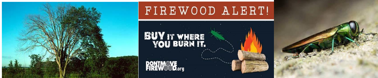
Dutch Elm Disease

Firewood can contain invasive insects like emerald ash borer or harbor invasive tree diseases such as Dutch Elm Disease (DED). Don't get caught with DED when buying firewood further than 80 km from where you originally purchased it! Always burn it where you buy it and do not return to your Summer Village with it to avoid the spread of invasive insects and diseases.