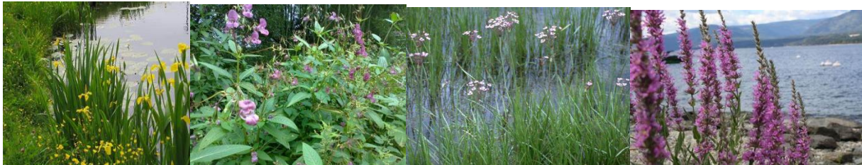
Yellow Flag Iris

Gardeners often are offered attractive species in the form of seeds or plant fragments. Emergent species have often been moved from one shore to line the edges of a pond or water feature. Many of the species can take over a lakeshore, ending the biodiversity and use of that water's edge. If you do not have full knowledge of what you might be bringing in to your pond, now you know to not do it. Some of these invasive ornamental species include yellow flag iris, flowering rush, Himalayan balsam, and purple loosestrife, and can all be found in Alberta.