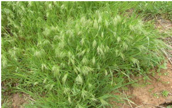
Down brome riparian infestation

Many lakeshore cottagers are keen to see a thick, green lawn and are tempted to seed or sod down as close to the shore as possible. In order for them to ensure invasive annual grasses such as downy brome or Japanese brome do not take a foothold on lake areas, cottagers need to ensure their sod or seed does not contain invasive species by asking their suppliers if their products are invasive-free. As well, too much nitrogen fertilizer can leach into the water, when fertilizing your shoreline grasses, which can enhance devastating algae blooms in lake areas.