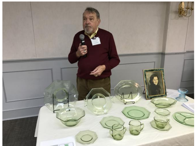
Melba or Pebbled Rim as it was called in the early years was made in 1930-36 and was the 4th pattern created by L.E. Smith in dinnerware. Originally in Pink and Green, later in 1936 added amethyst. It was given away at movie theaters.