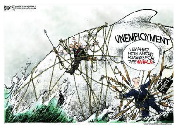
THE GREAT WHITE WHALLE

requirements. More cost, combined with more difficulty in providing health care benefits to employees, points to only one thing ...... a significant disincentive for hiring!