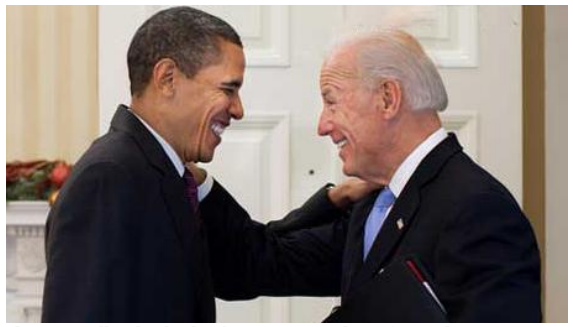
They Actually Think They're Creating Jobs! - from The Patriot Post

I hesitated from even putting my thoughts down on paper for this report. To me, some of these things seem too obvious to even mention. But yet again, it appears that the obvious (for me) is escaping notice by the current administration. Obama is trying to walk a tightrope between elements of his base – unions on the one side, and devout environmentalists on the other – as regards energy policy and energy independence. The thin tightrope of "nuance" is getting thinner