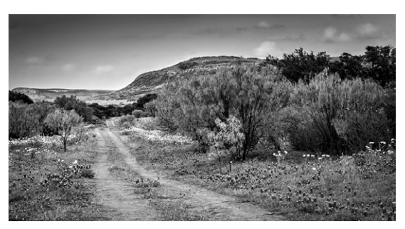
Out Willow City Way - 27 Rose Epps