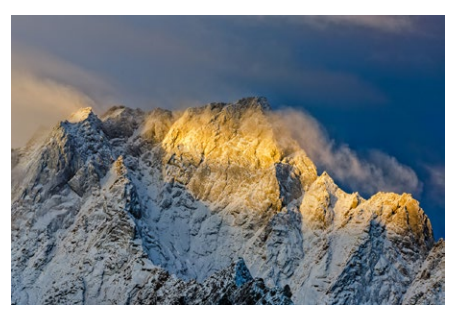
Sun-Kissed Peak - 27 Dan Tonissen