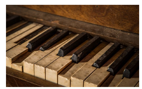
Tired Keys - 27 Linda Avitt