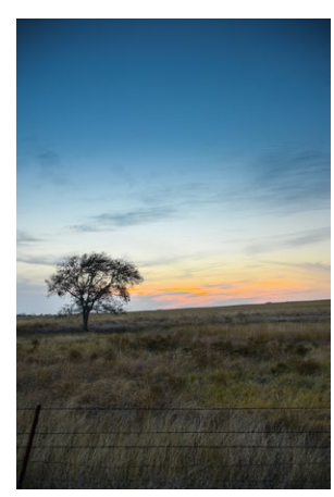
Sunrise Over Round Rock - 26 Pamela Oldham