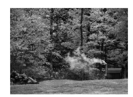
Smokin' Smokehouse - 27 Lois Schubert