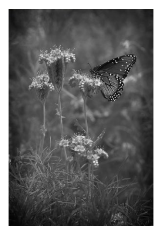
Butterfly on Phacelia in Gillespie County - 27 Jeff Lava