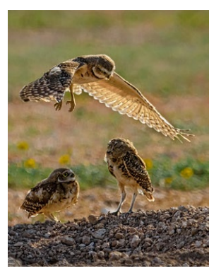
Oh No! - 27 Linda Sheppard