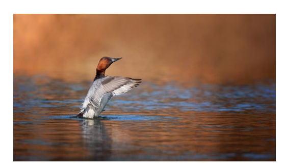
A Canvasback Concert - 27 Cheryl Callen