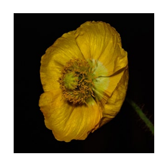
Icelandic Poppy - 27 Dolph McCranie