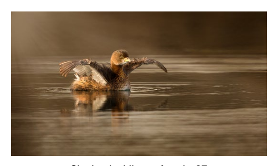
She Looks Like an Angel - 27 Cheryl Callen