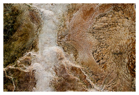
Yellowstone Thermophiles - 27 Diana Dworaczyk