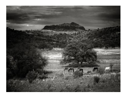
Horses at Prude Ranch - 27 Pete Holland