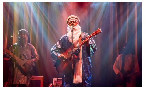
Tinariwen at the Granada Theater, Dallas