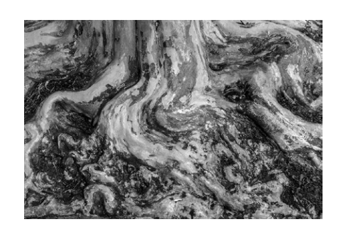
Tree Trunk - 26 Lois Schubert