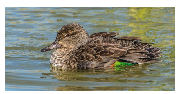
Nice Bath - 27 Joyce Bennett