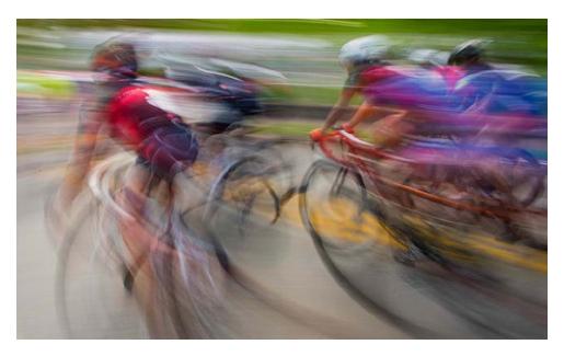
Wind in Your Face - 27 Stennis Shotts