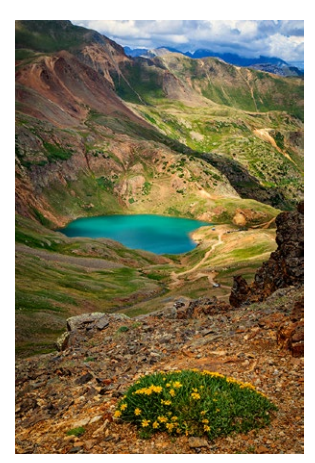
Lake Como - 27 Rose Epps