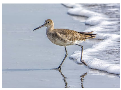
Wading Willet - 27 Paul Munch