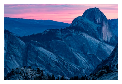
Snoopy Sunset - 27 Dan Tonissen