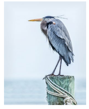
Down Time - Great Blue Heron - 27 Paul Munch