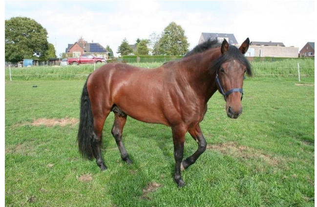
Sniekershofs Allen’s Gust

He is a Full Heritage stallion and his stud fee is €800. You're welcome to make further inquiries, please contact "Sniekershof-TWH" by e-mail or by phone. info@sniekershof-TWH.be mobile +32 471 74 20 48