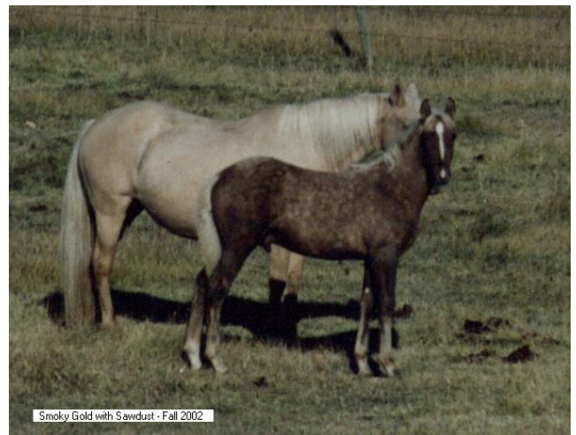
“Smokey” as a foal in 2002

Introducing Uphill Heir Trigger, also known as ‘Smokey’, a descendant of Roy Roger’s ‘Trigger Jr’. But as a 4-month-old, this was his first change of coat! He looked nothing like a ‘real’ palomino so we called him ‘Smokey’. (Of course, by the next spring he’d lost the dark dapples and shed out to a golden palomino colour, but... the name stuck!)