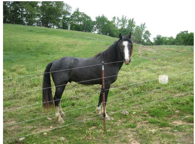
Echo's Confederate Rebel