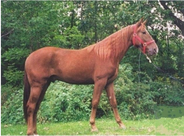
Duke in his younger years

natural, loose moving foals. I am very thankful for the opportunity to own Duke and raise foals by him. He has settled in well here and is a very nice horse. I love this horse! He is a peach to handle at breeding time and I end up breeding mares alone so he has to behave himself and he does. Hearing from buyers who have purchased Duke's foals over the years, they are very sensible and easy to train. It was a huge blessing to be able to acquire this horse and continue breeding these wonderful Echo horses!!