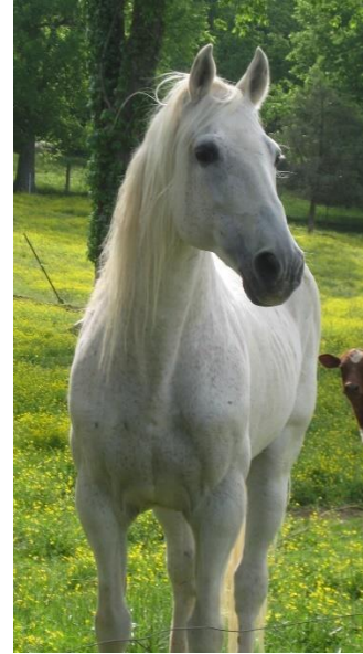
Buds Sterling Bullet

Owner Debbie Jeppeson of Walkers on Water in Great Falls, Montana, has added this Heritage stallion to her stallion line-up. She is offering him at stud and writes on the farm website : "Black, Heritage-certified stallion with disposition, gait, and size. Limo stands 17hh and may be one of the last of the King Pin line still breeding. With a big heart and a gentle soul, this stallion is a pleasure to be around and fun to work with. Limo stands for live cover in Great Falls, MT but we can ship semen. Color genetics Ee/aa. Stud fee is $400; cost for AI is $600 (includes collection and shipping). PM or call 406-799-2116 for more info!"