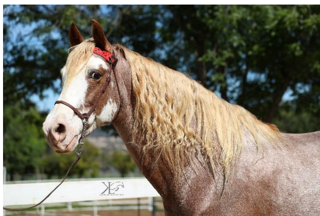
NFF Wilson's Society King