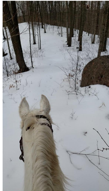
Ostella's Della Ann breaking trail

“We were riding near Antigo, WI along the Wolf River. The snow was 18"-20" with a 4" crust = poor riding conditions this year, the horses didn't really like it, especially the one in the lead! Still fun to ride for a day in big forest.”