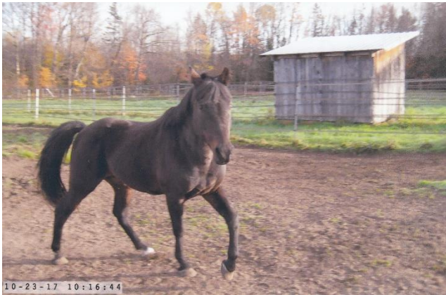
Remembrance's Legacy Photo taken 10-23-2017