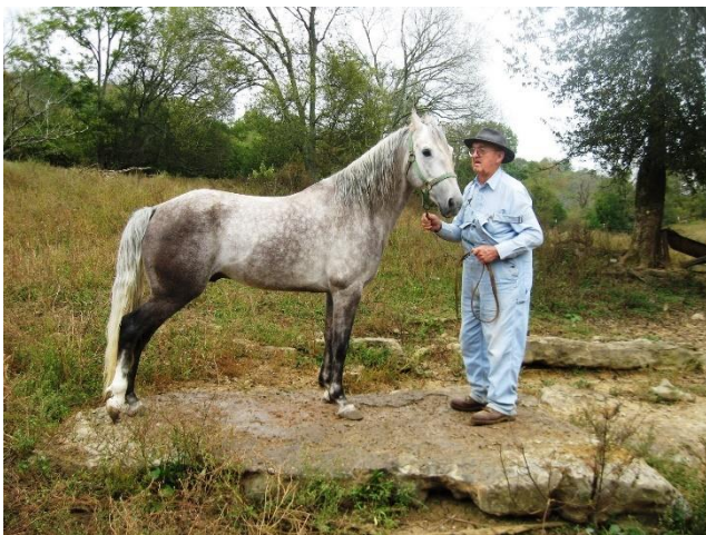
Ostellas Bullet Trademark

While Bullet was trail ridden many times as a younger stallion, he was never shown. There was no time for it. As soon as he was offered at stud, the mares came to his court. And the mares returned, for his foals were good looking, stylish movers, often with the added sparkle of silver. Riding horses by Buds Sterling Bullet have gone to many different states, to Canada, and to Europe. Some of his best foals have been linebred to his dam's sire, as the cross of Bullet on a Red Bud's Rascal mare was proven as a winning combination early in the stallion's career. Bullet today at age 29 continues to impress visitors to Brown Shop Road Farms with his still-elegant appearance and his ready obedience to his owner's voice commands. He is no longer ridden, but loves attention from people, and will stand happily while they pat or scratch or just discuss his merits.