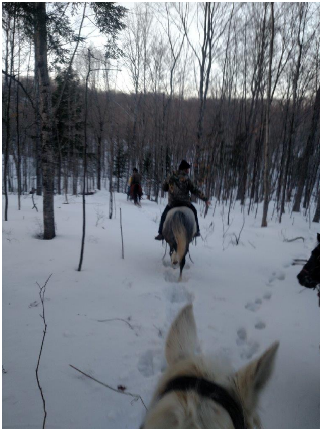
Taking turns breaking trail

IHWHA memberships for Family and Individuals go from January 1 to December 31 each year. Enclosed in this newsletter is a membership application.