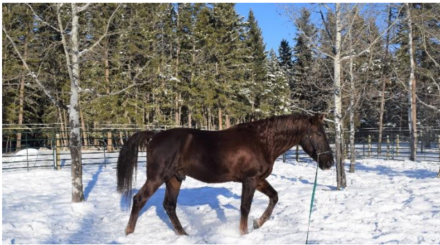
Tsuniah Red Willson’s Echo