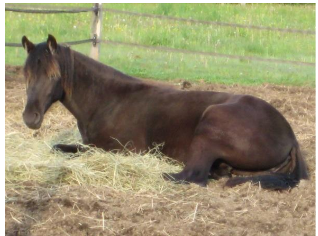
Jubilee's Naughty Kisses

"Kisses" is a large solid black filly foaled in June, 2008. Her sire is Remembrance's Jubilee (buckskin), and her dam is Prowlin' Woman (black ). Naughty Kisses, with training, will make a wonderful riding horse. She is big, smart, gaits like a champ, and is just a really fun personality.