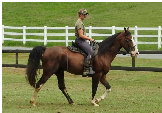
Carbonado Bay At The Moon