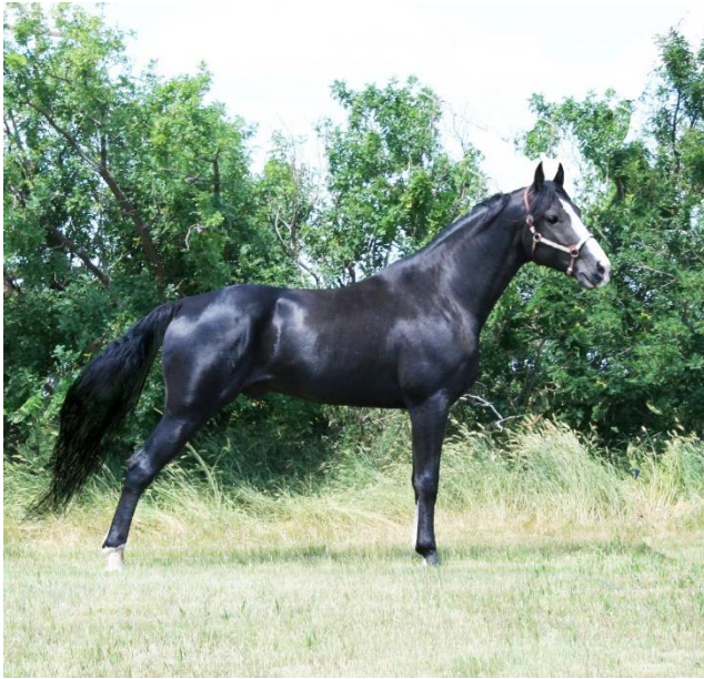
SCW Counting Cadence