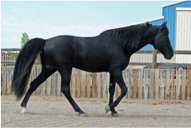
Cruise With The Limo