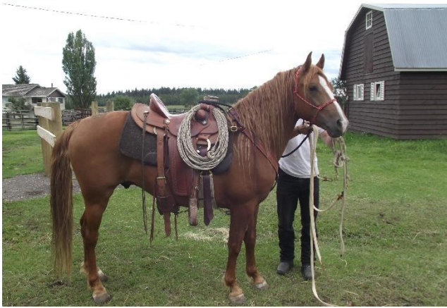
NFF Society King’s Opus

“Opie” is sired by NFF Wilson’s Society King and out of Rascal’s Favorite Lady, a Red Bud’s Rascal daughter.