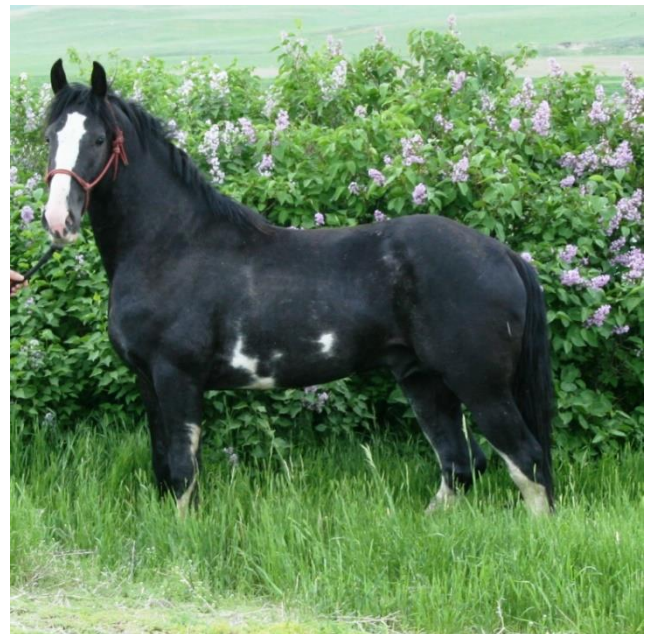
SCW He's a Midnight Legend