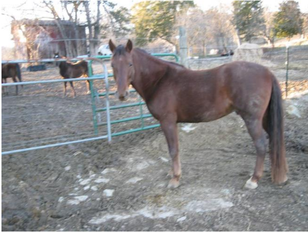
Gen Jeb Stuart CSA

Gen Jeb Stuart CSA, is a son of Society's Dan Allen, his dam is Echo's Merry Co-ed, making Jeb line bred Paige's Echo. Jeb has bred only one mare, a Sun's Smokey Midnight/Echo's Society Angel mare; she's due in April. We are expecting some nice foals from Jeb in the future.”