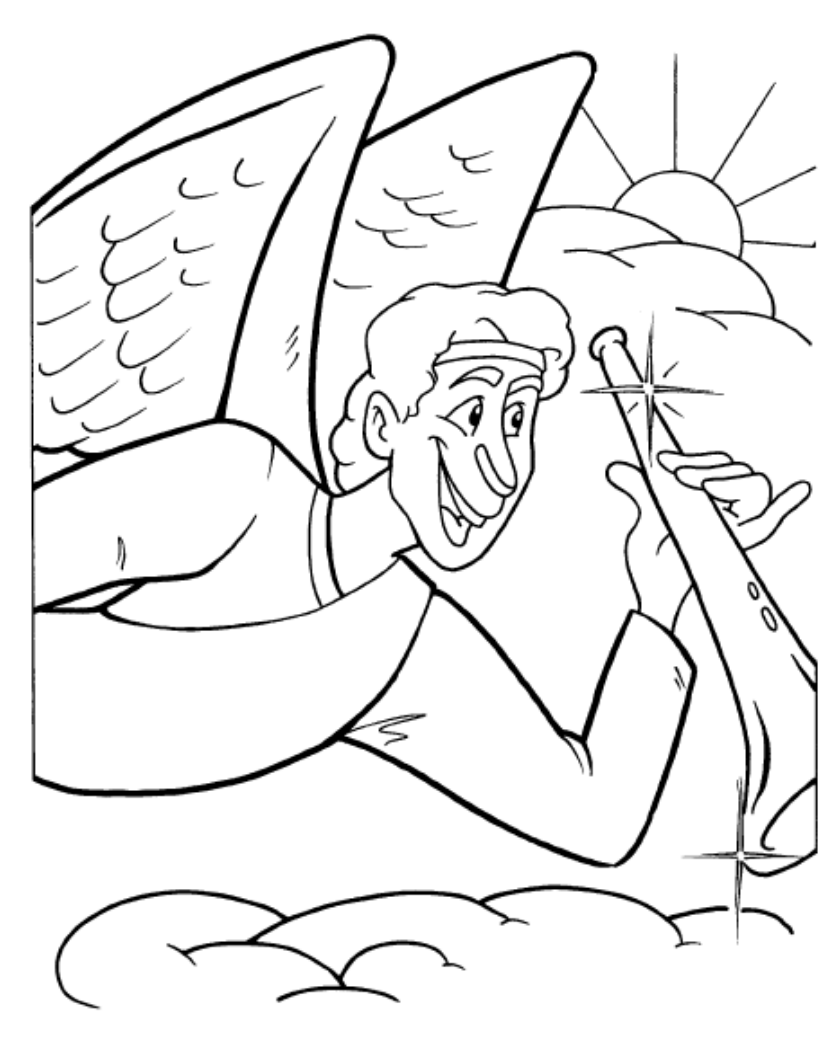
And he will send his angels and gather his elect from the four winds, from the ends of the earth to the ends of the heavens. Mark 13:27 (NIV)

Copyright © CalvaryCurriculum.com Used by Permission