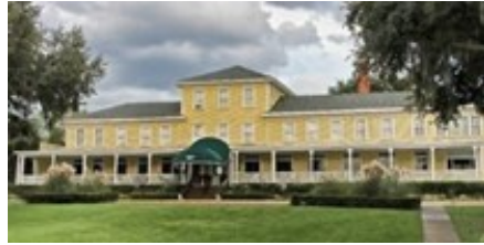
The historic Lakeside Inn in Mt. Dora was the setting for the November 29 Inside the Arts outing.