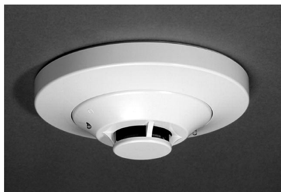
IDP-Ion in the B210LP mounting base (Base not Included)