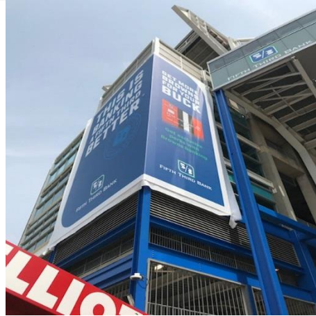
Example of Large Outdoor Frames