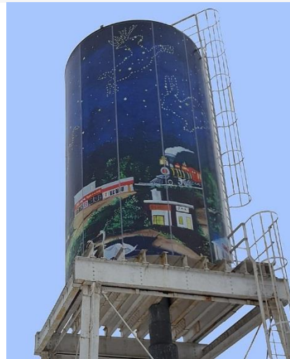
Decommissioned Water Tower- Decorative Graphic