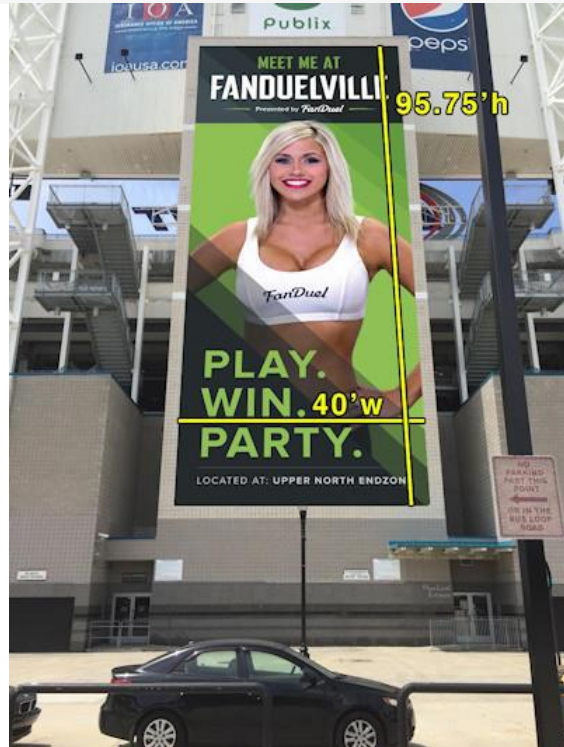
Large Frame-Stadium- 95.75' x 44'