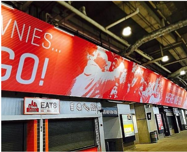
Food Court Vinyl Banner- 310' x 113' - Browns stadium