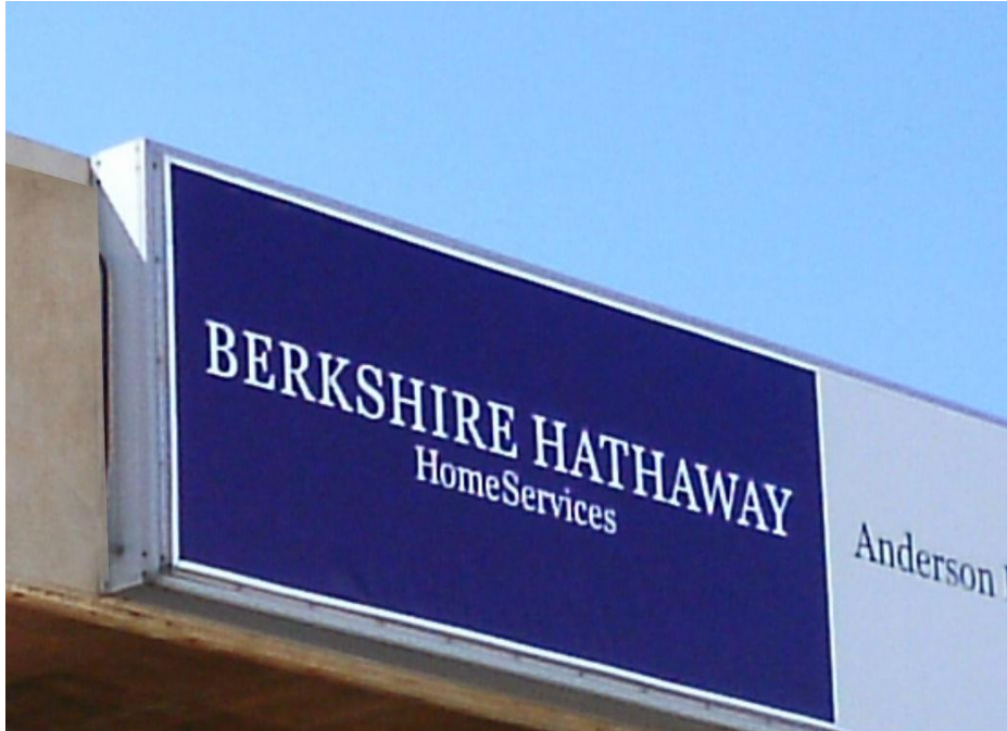
Existing Light Box, Refaced with the TS23 Extrusion frame with a printed translucent vinyl.