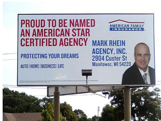
Outdoor Billboards - 6' x 11'