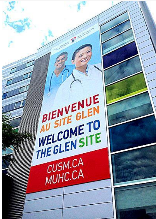
Hospital Entrance - 41' x 17'