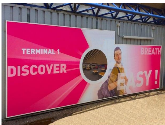
Non-Rectangular Frame with a perfect stretch