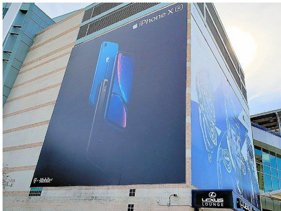
Arena Entrance -48' x 65'