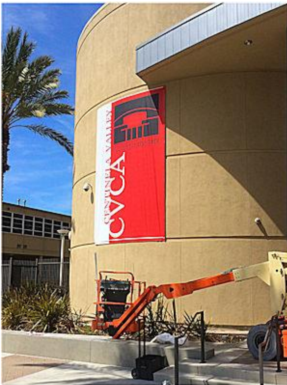
Works Fine with Curved Frames...