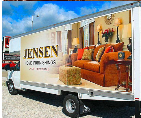
...and for Box Trucks & Trailers...