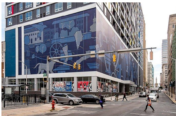
Building wrap with seamless corner (~17,000 sq. ft)