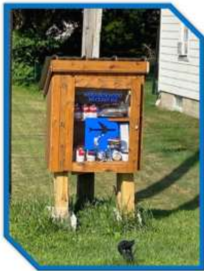
Food Stand Ministry