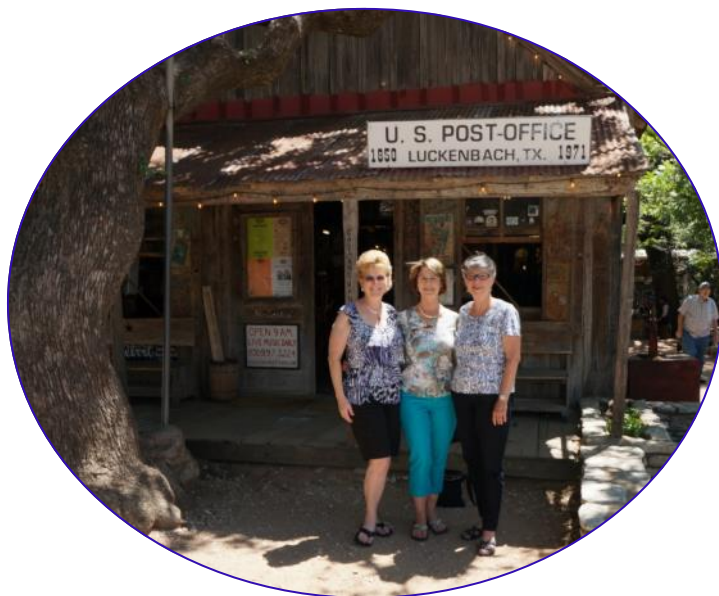
Enjoying the stops along the way during the Poker Run