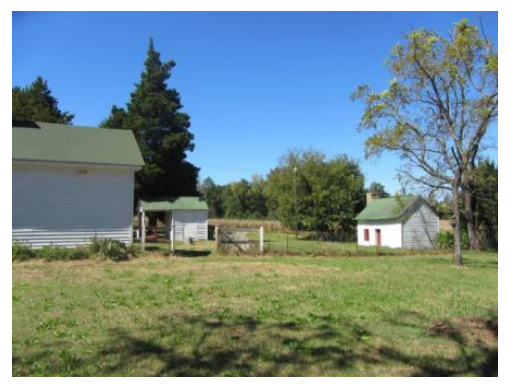
Figure 16. NCDOT Survey #45, Dr. Joseph A. McLean House (GF-1535), 6069 Burlington Road, Guilford County, looking west; visible from left to right are the east elevation of the early twentieth-century rear ell of the main house, the wellhouse, and the log kitchen.