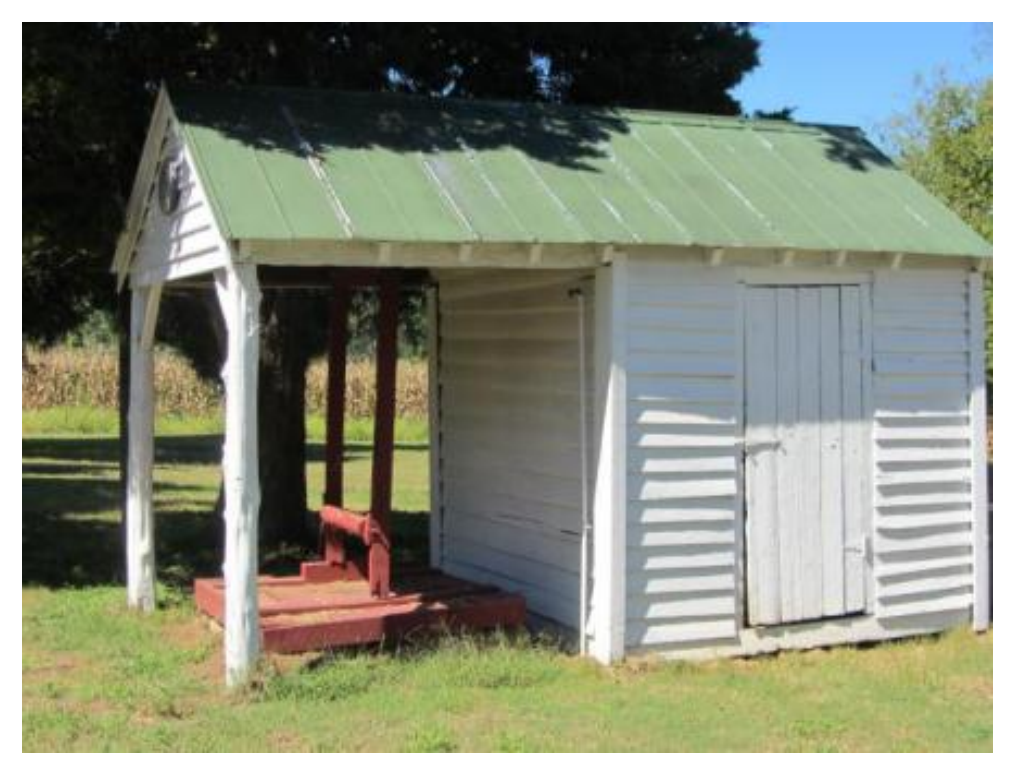
Figure 20. NCDOT Survey #45, Dr. Joseph A. McLean House (GF-1535), 6069 Burlington Road, Guilford County, wellhouse with open gable bay off south elevation on the left and entrance on east elevation, looking northwest.