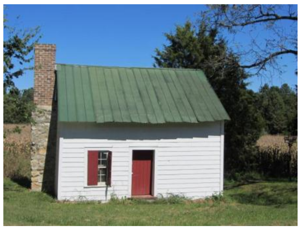
Figure 19. NCDOT Survey #45, Dr. Joseph A. McLean House (GF-1535), 6069 Burlington Road, Guilford County, log kitchen, south façade, looking north.