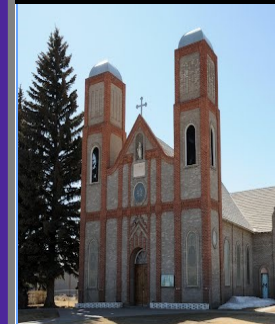
Our Lady of Guadalupe Parish Oldest Parish in Colorado Established in 1858