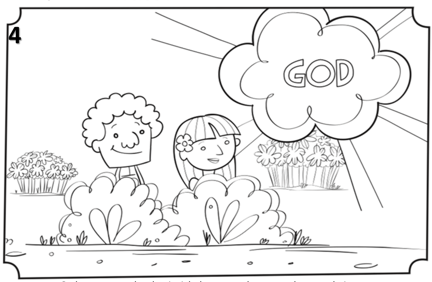
God wants us to do what is right but even when we make poor choices, God still loves us and is always with us!