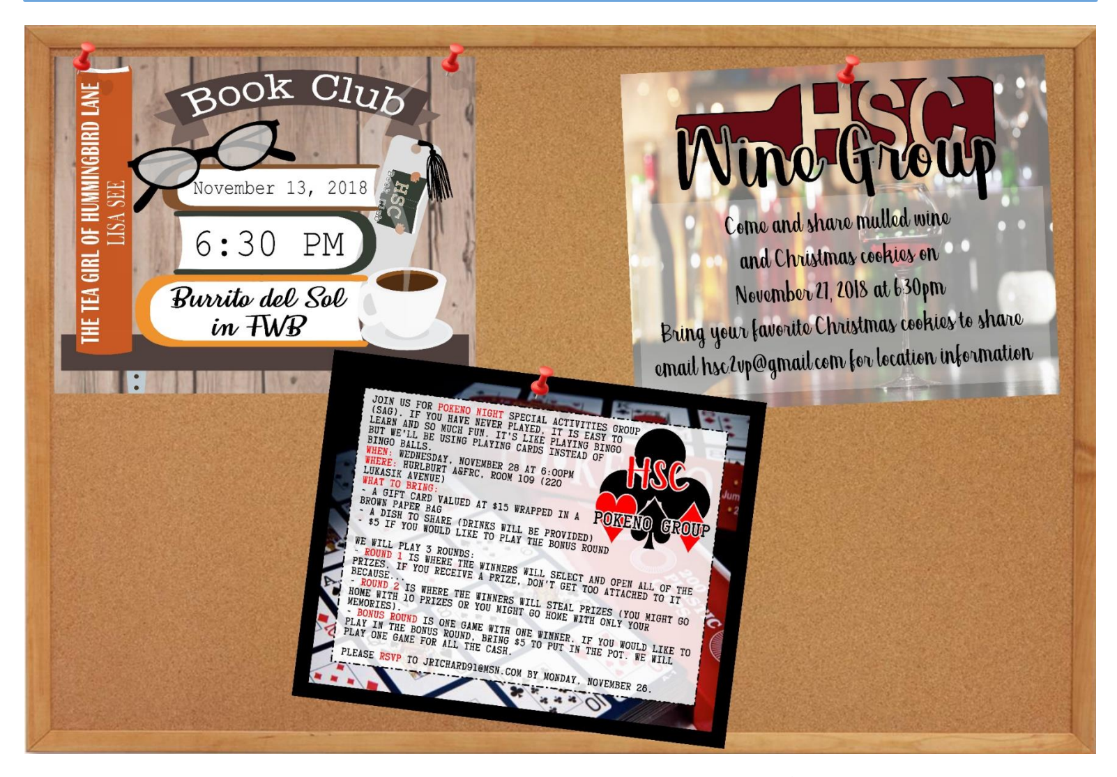
November 2018 -- Hurlburt Spouses' Club -- The Sound -- Page 4

What interests you? For more information or if you'd like to join one or more of the groups (or start your own), please contact <a href="https://www.nc.specactivities@gmail.com">hsc.specactivities@gmail.com</a>.